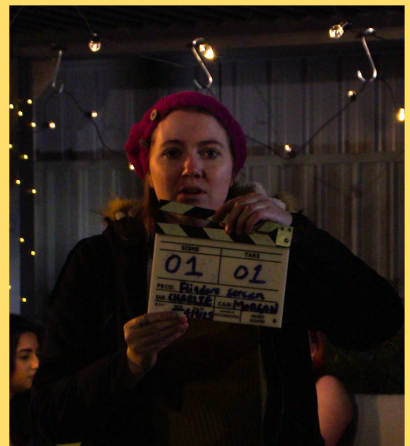
The first slate of the film. :)