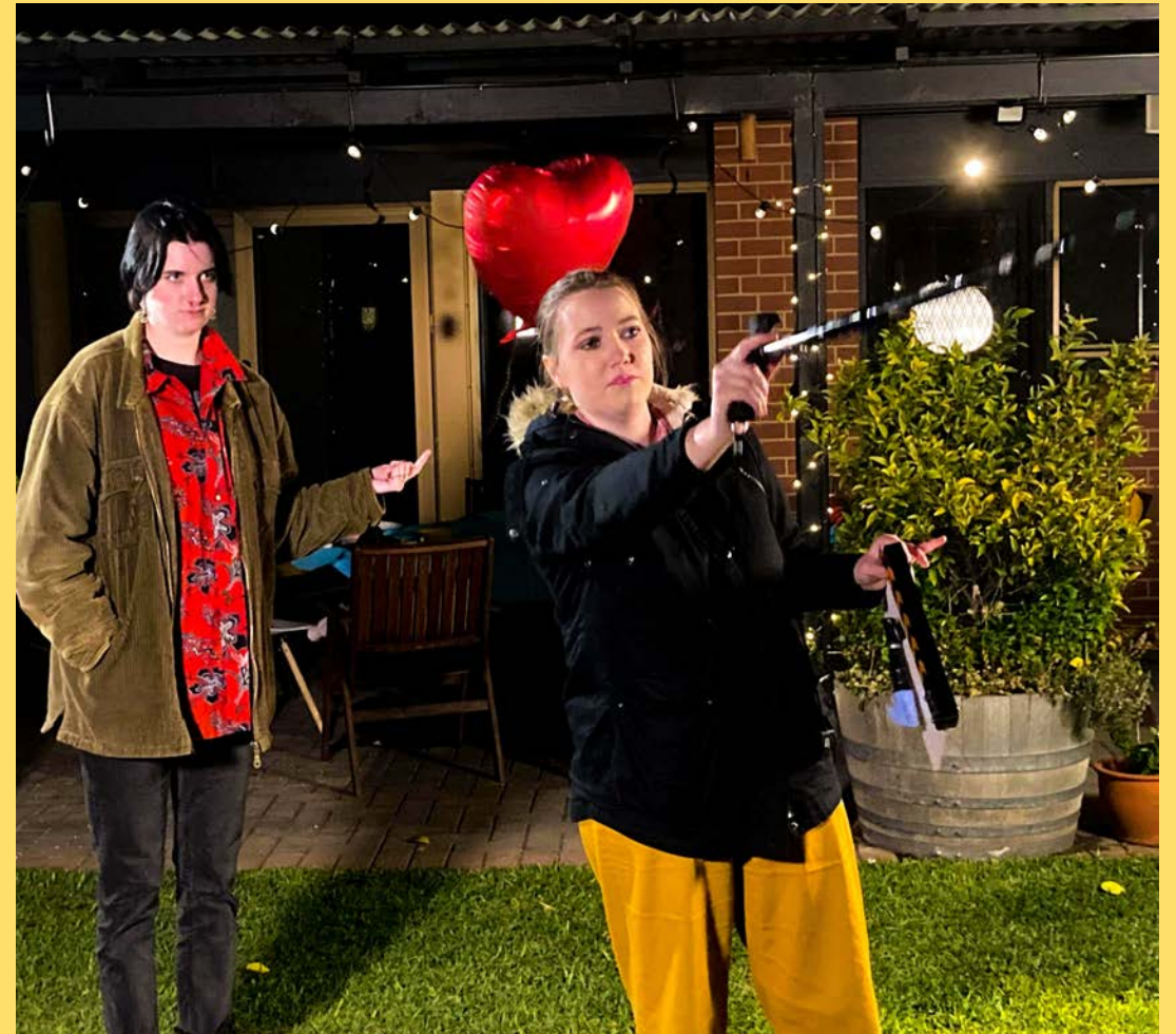
I discovered my walking stick can also be used to point out eyelines for actors