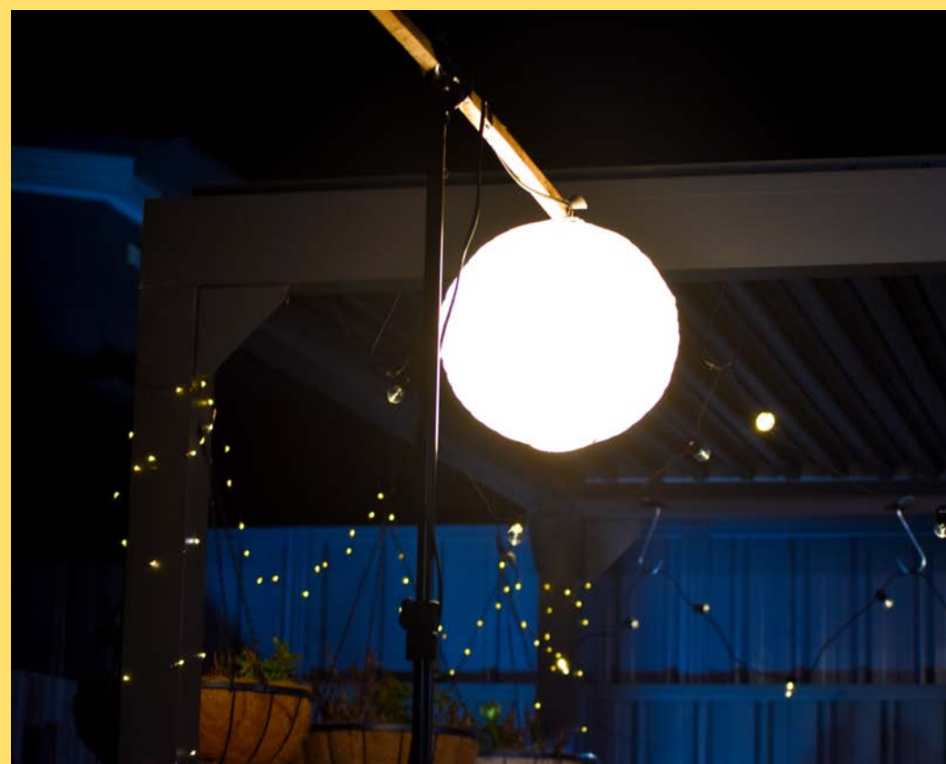
(and HUNDREDS of fairy lights