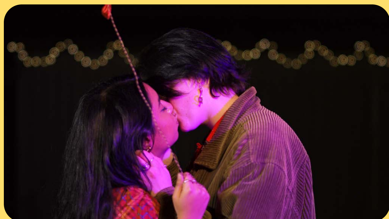
The two share a kiss as fireworks go off in the distance.