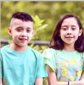
CHILD ACTRESS: AS ALEJANDRO AND LUCIA