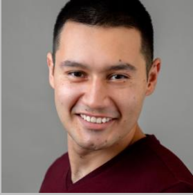
ACTOR: AS PEDRO (TRUCK PASSENGER)