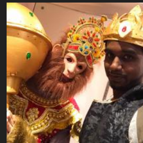
Ramayana Theatre play as Prop master & Actor