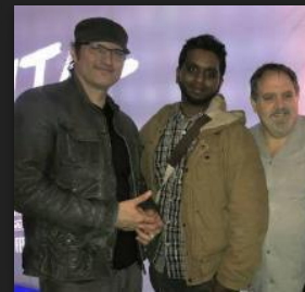
Premiere of Allita: Battle Angel , with Director Robert Rodriguez ( Sin City ) and Producer Jon Landau ( Avatar , Titanic )