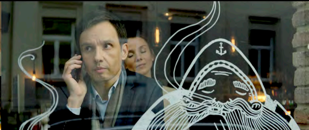
Erik Borner / film debut & world premiere