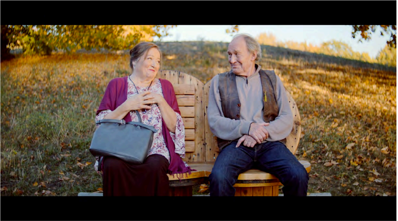
Marianne Sägebrecth and Michael Mendl ( Scene at the autumn lake )