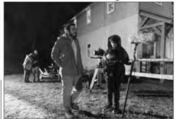
Crews shot at night at Blueberry Hill Hunting Club in 2019.

ing and everything going on -- I don't want to premiere it when it's getting too cold out, if we can't get it out there by mid-November we might just do an online premiere," he said.