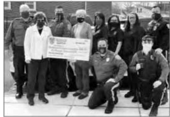
The Hammonton Police Department's "Pink Ribbon" raised $640 for the