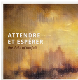
Dylan Thomas (Bitter Bitter) The Duke of Norfolk

For the avoidance of doubt, the Client is hereunder granted with the right to perform and reproduce the Song in public as part of the Project and the Artist waived any accruing remuneration and royalties that it would be otherwise entitled to for such public reproduction of the Song, including any remuneration that would be charged by collecting societies.