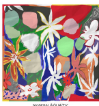
Laurel Leaves Modern Aquatic

For the avoidance of doubt, the Client is hereunder granted with the right to perform and reproduce the Song in public as part of the Project and the Artist waived any accruing remuneration and royalties that it would be otherwise entitled to for such public reproduction of the Song, including any remuneration that would be charged by collecting societies.