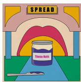
Everything Else but You These Nuts

For the avoidance of doubt, the Client is hereunder granted with the right to perform and reproduce the Song in public as part of the Project and the Artist waived any accruing remuneration and royalties that it would be otherwise entitled to for such public reproduction of the Song, including any remuneration that would be charged by collecting societies.