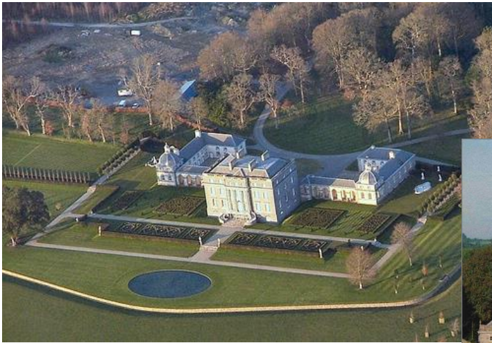
William Conolly and his Mansion in Castletown