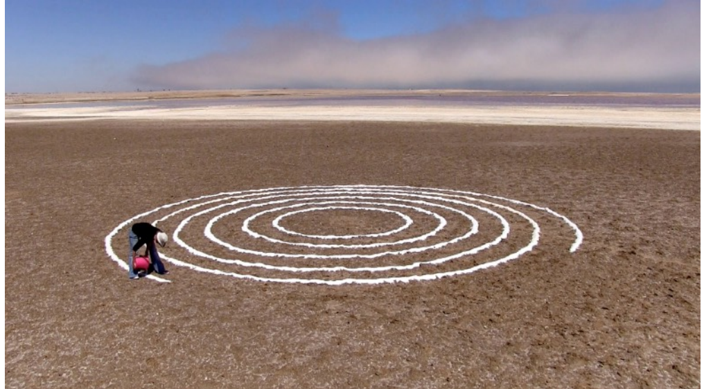
Making of the Salt Circles

Concerned about the ever-increasing uranium mining in Namibia a local artist sets out to give the Namib Desert a voice.