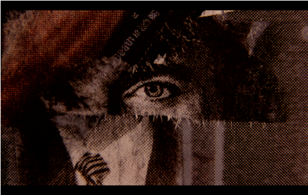
still from the animated music video (This Gilded Age) So What Are You Looking At?