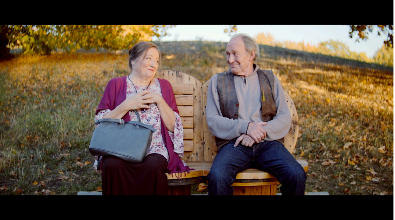
Marianne Sägebrecth and Michael Mendl ( Scene at the autumn lake )