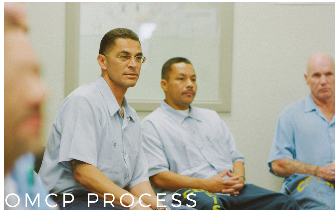
OMCP PROCESS GROUPS