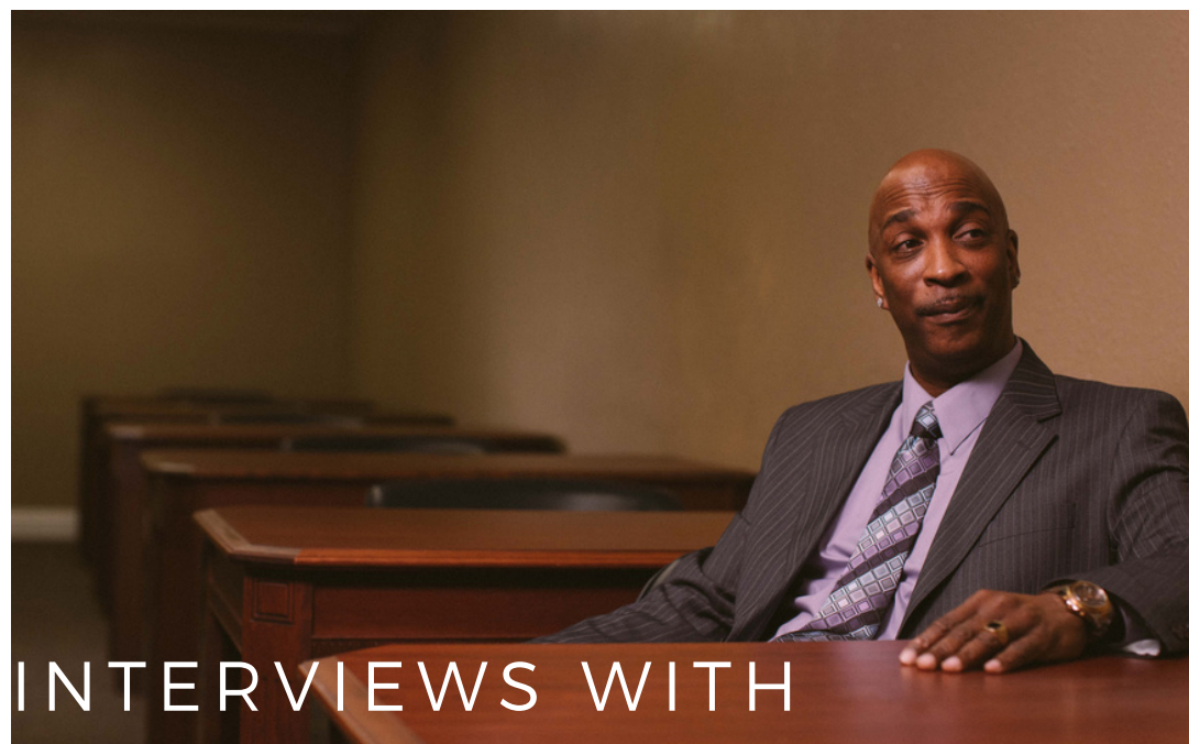
INTERVIEWS WITH OMCP PARTICIPANTS AT HOME AND WORK