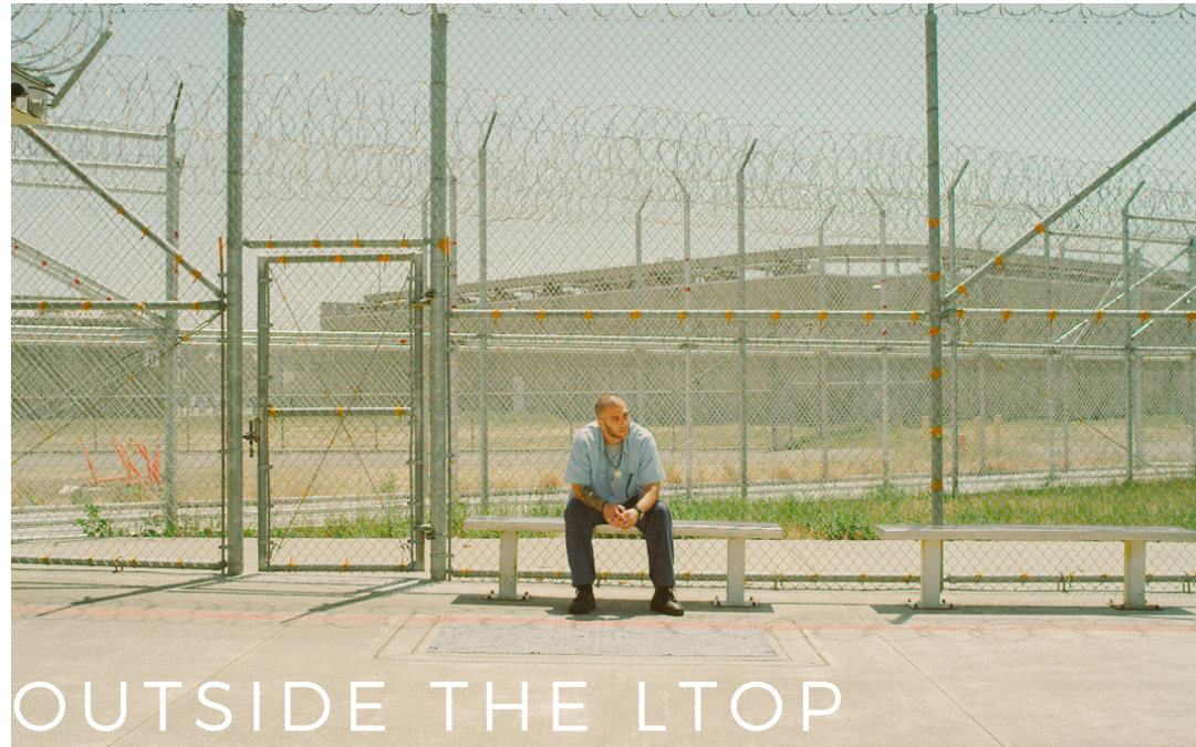
OUTSIDE THE LTOP BUILDING AT SOLANO STATE PRISON