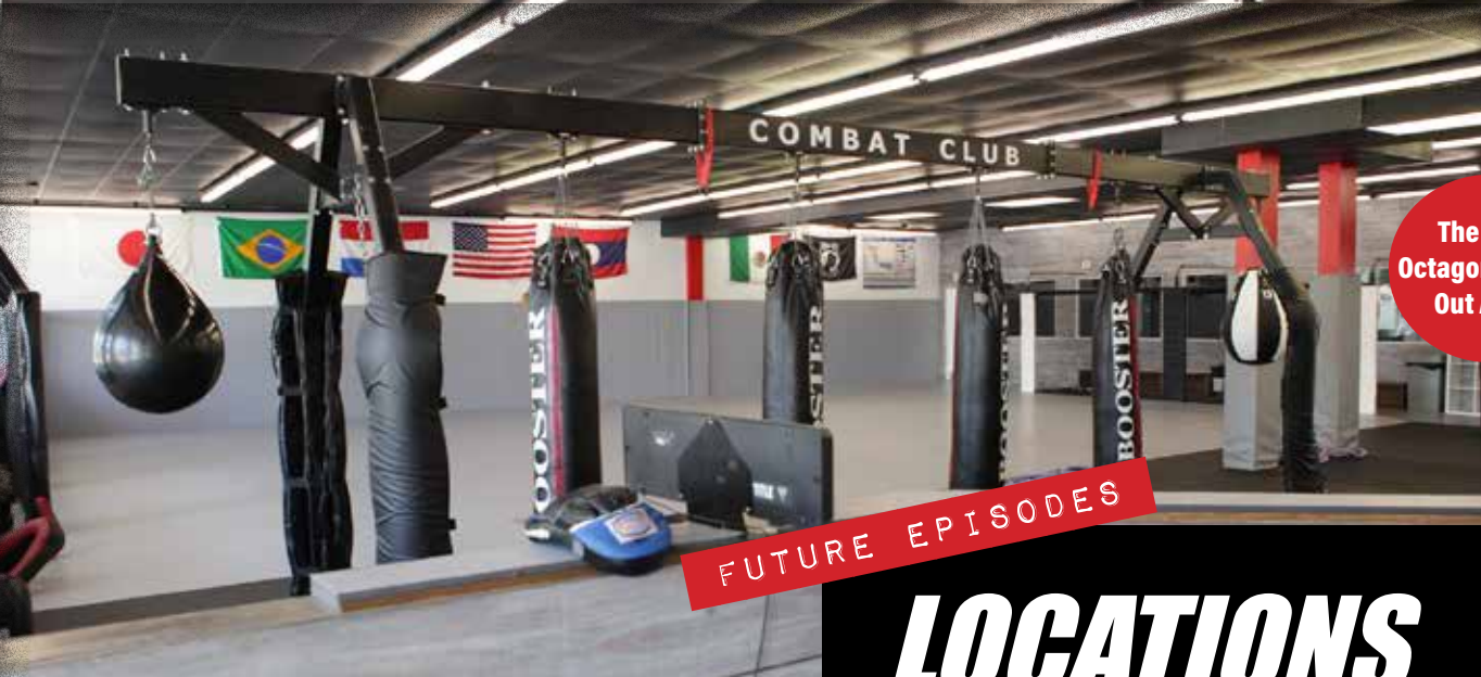
The Gym, Octagon & Work Out Areas