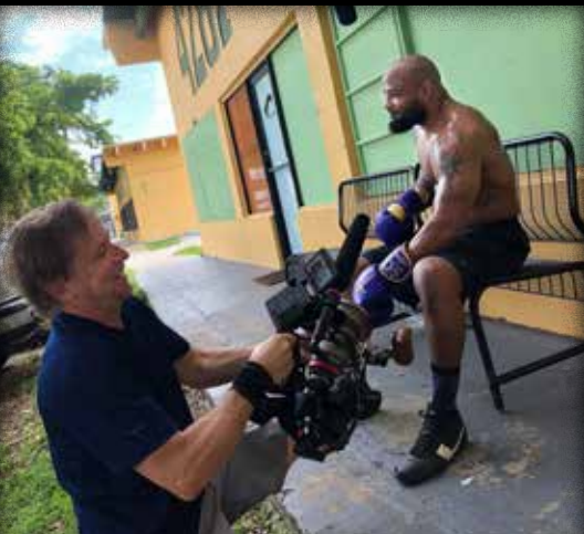
Shooting Yoel Romero in Miami

With successful ties to MMA fighters and trainers in South Florida, the COMBAT CLUB show producers have a long-standing history shooting feature segments for broadcast and promotion.