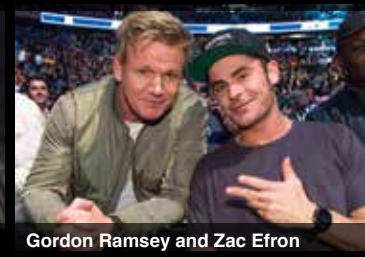
Gordon Ramsey and Zac Efron