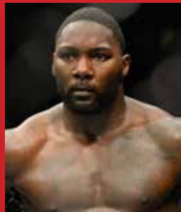
ANTHONY JOHNSON "Rumble" UFC Light Heavyweight