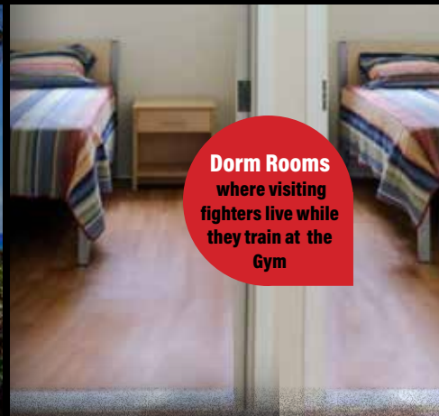
Dorm Rooms where visiting fighters live while they train at the Gym