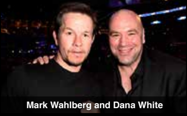
Mark Wahlberg and Dana White