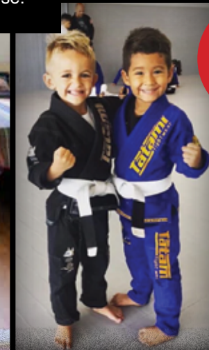
After School Play Areas for kid & parent storylines