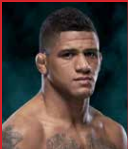
GILBERT BURNS "Durinho" UFC Lightweight