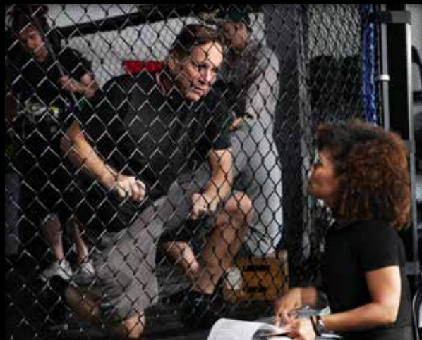
Show Producers on the set of COMBAT CLUB