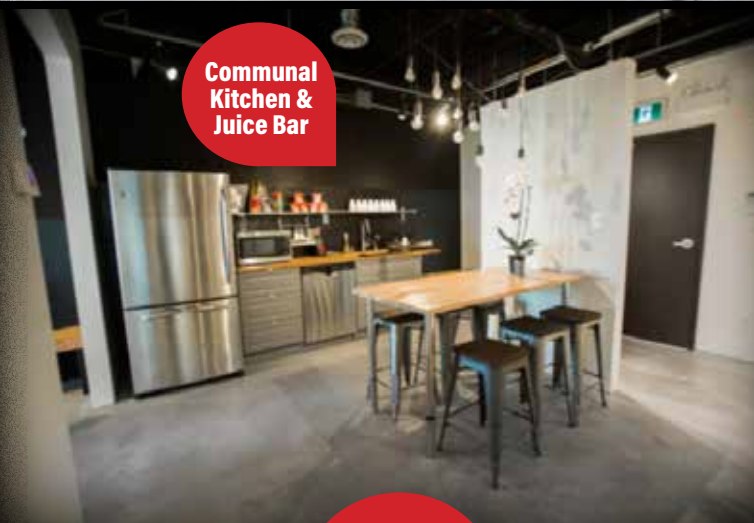
Communal Kitchen & Juice Bar