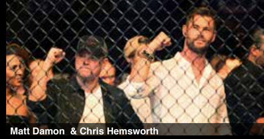
Matt Damon & Chris Hemsworth