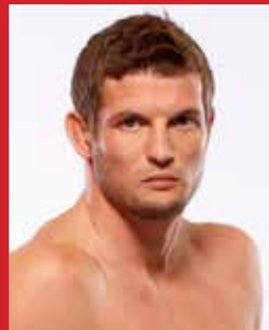
CHAS SKELLY "The Scapper" UFC Featherweight