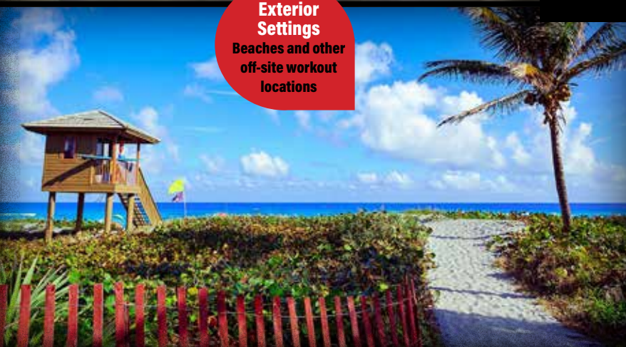
Exterior Settings Beaches and other off-site workout locations