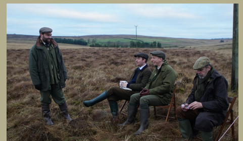
Film Still and BTS Photos