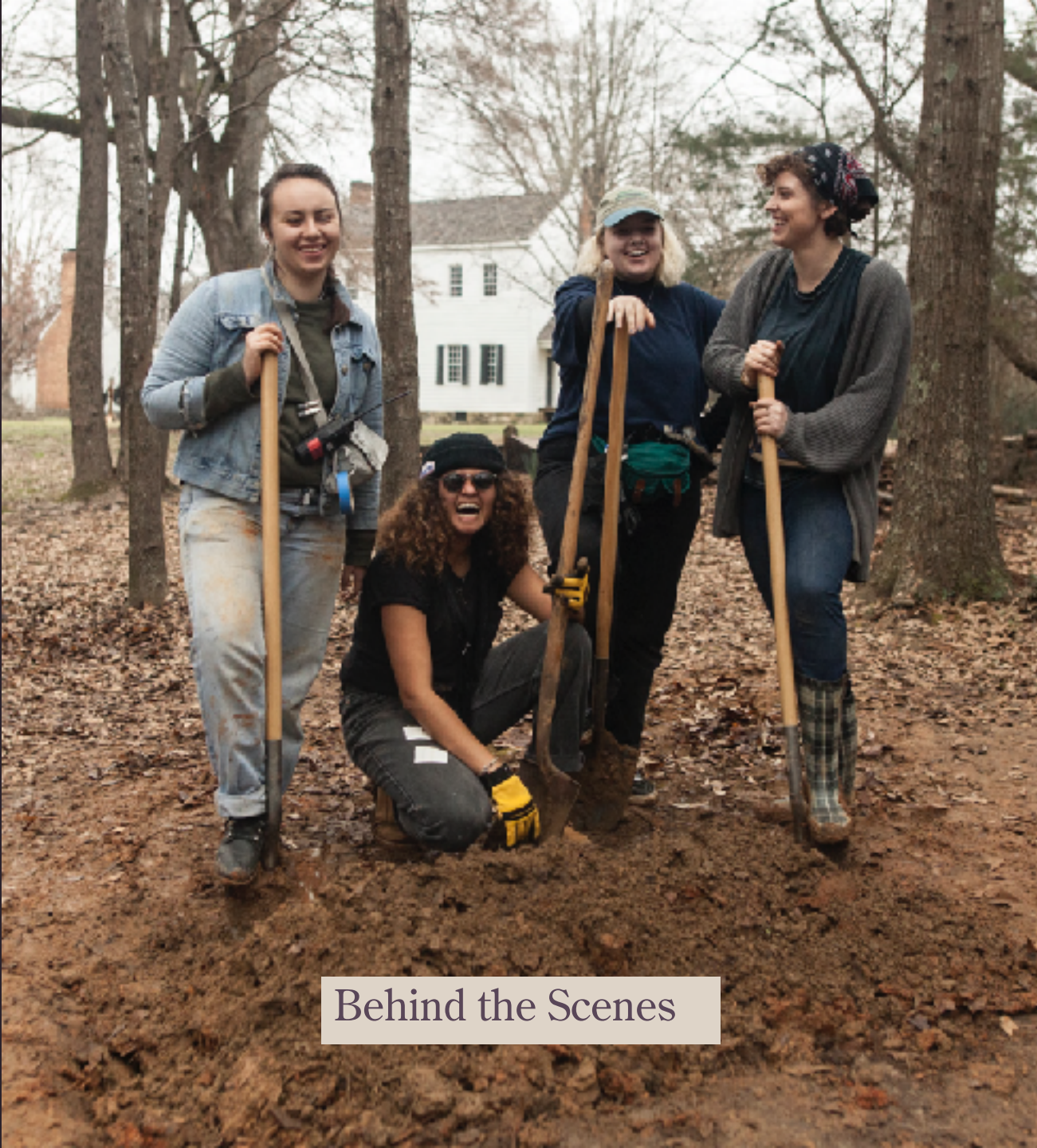
Behind the Scenes