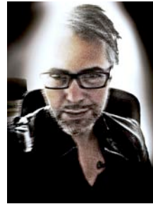
Schahram Poursoudmand Music & Sound Artist * Composer Visual Imagist * Poet