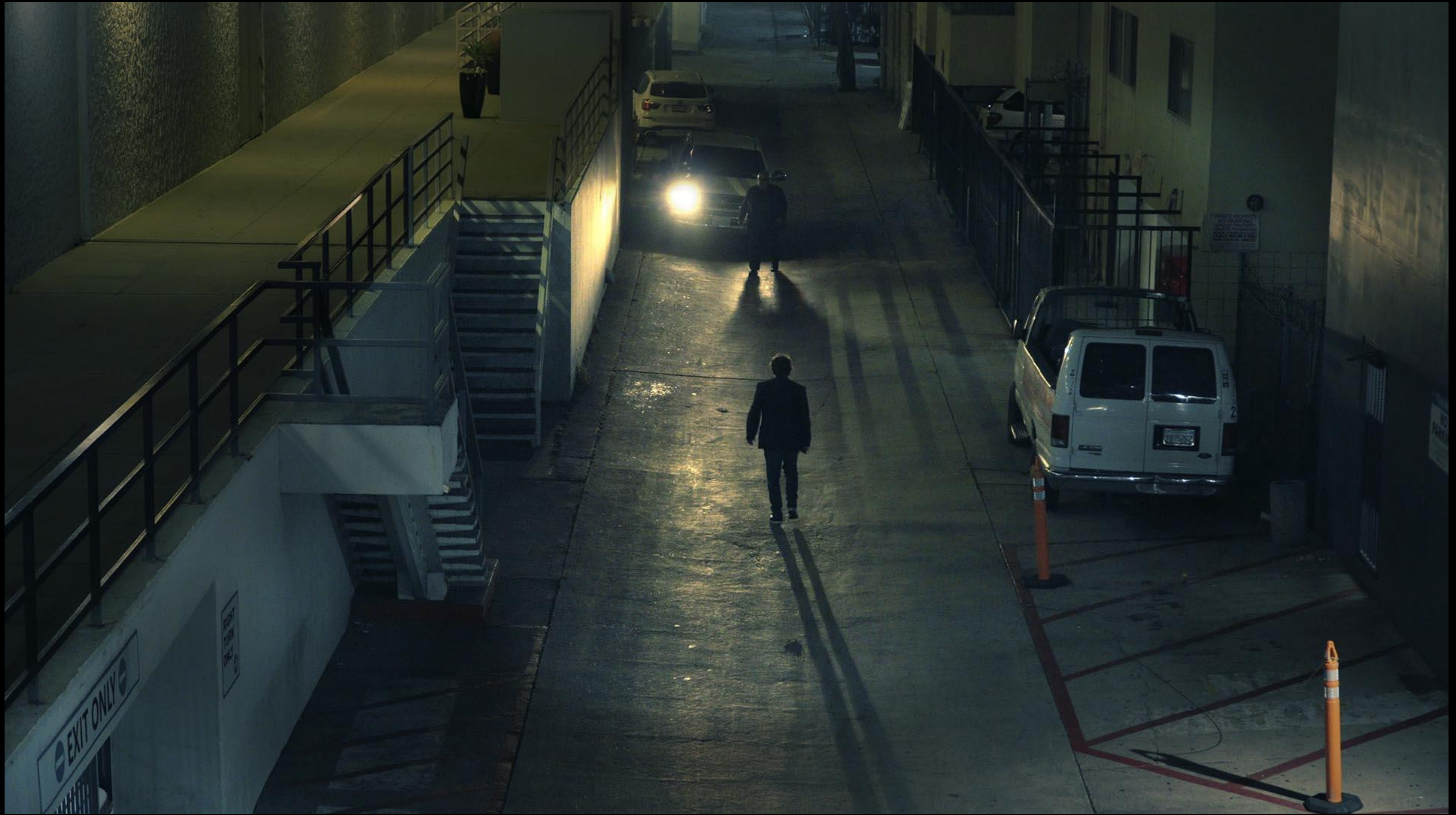
The Hitman waits for the Fly.