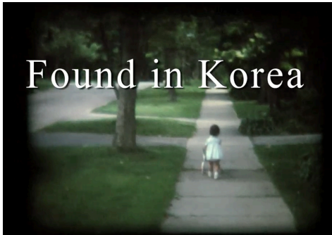
Found in Korea screen capture