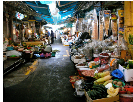
On location in S. Korea: Busan market