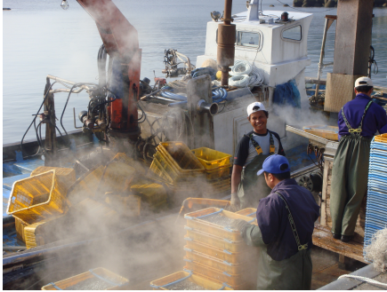
On location in S. Korea: Namhae fishing boat