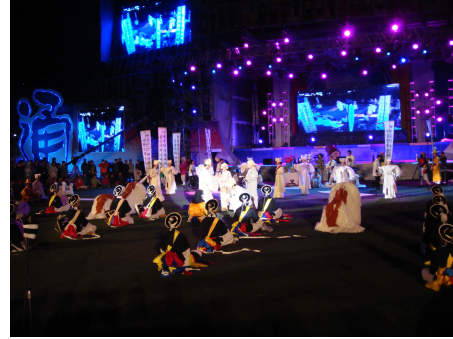
On location in S. Korea: Seoul street performance