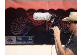
On location in S. Korea