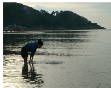
On location in S. Korea: Namhae beach

I wanted to create a film where the lead character is someone I could have related to when I was young. Found in Korea is geared towards children: target age 10; however, children far younger and adults far older can enjoy this documentary. I created the film so that children