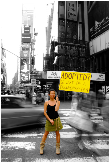
On location in Times Square NYC