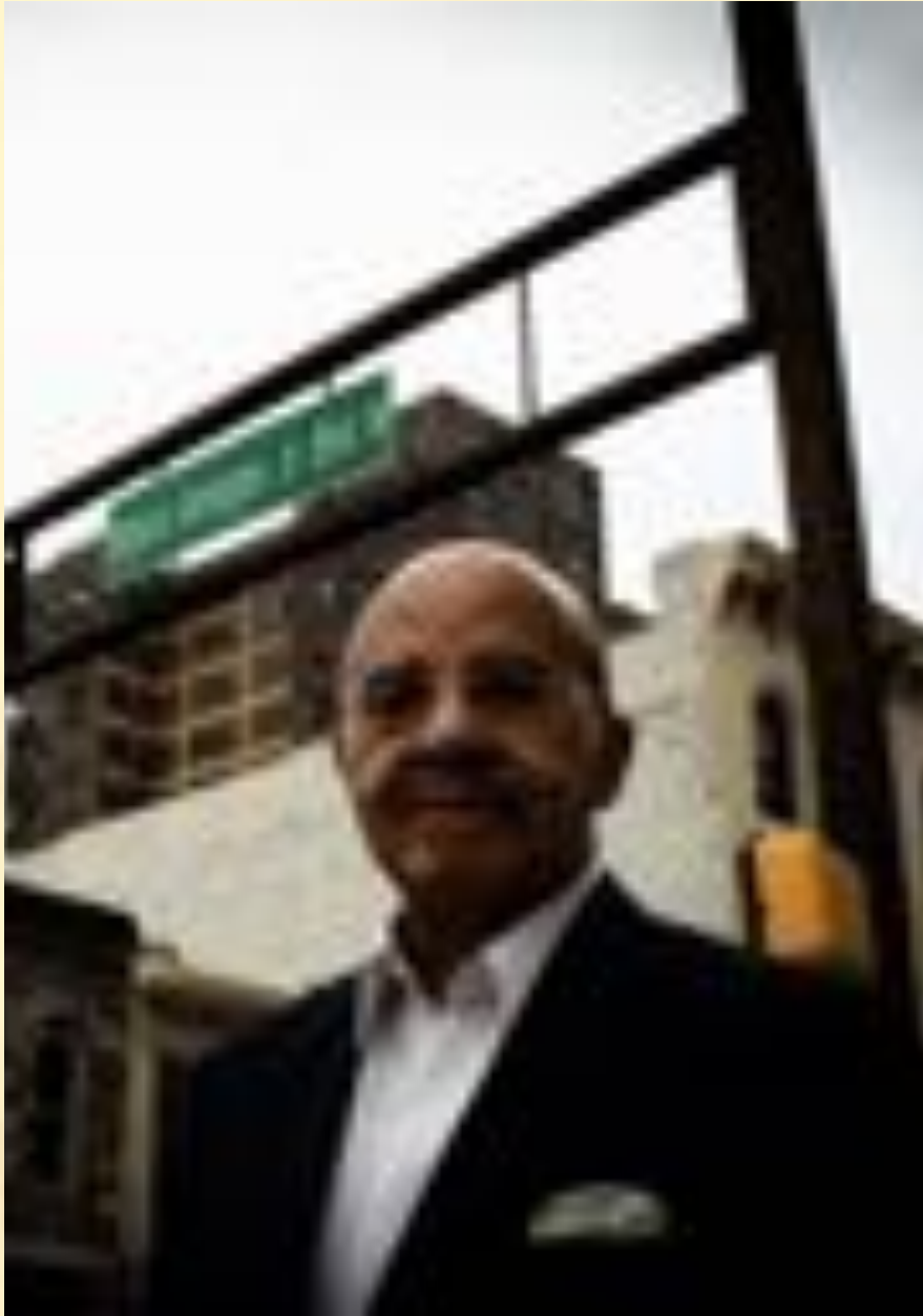
DR. RICHARD ARRINGTON JR.