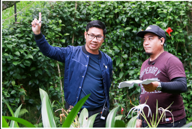
DIRECTOR AND D.O.P