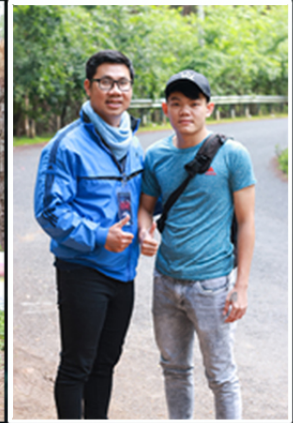
ON-SET SOUND RECORDER