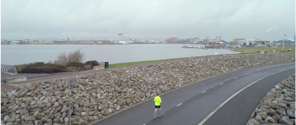
Introduction montage, Cardiff Bay