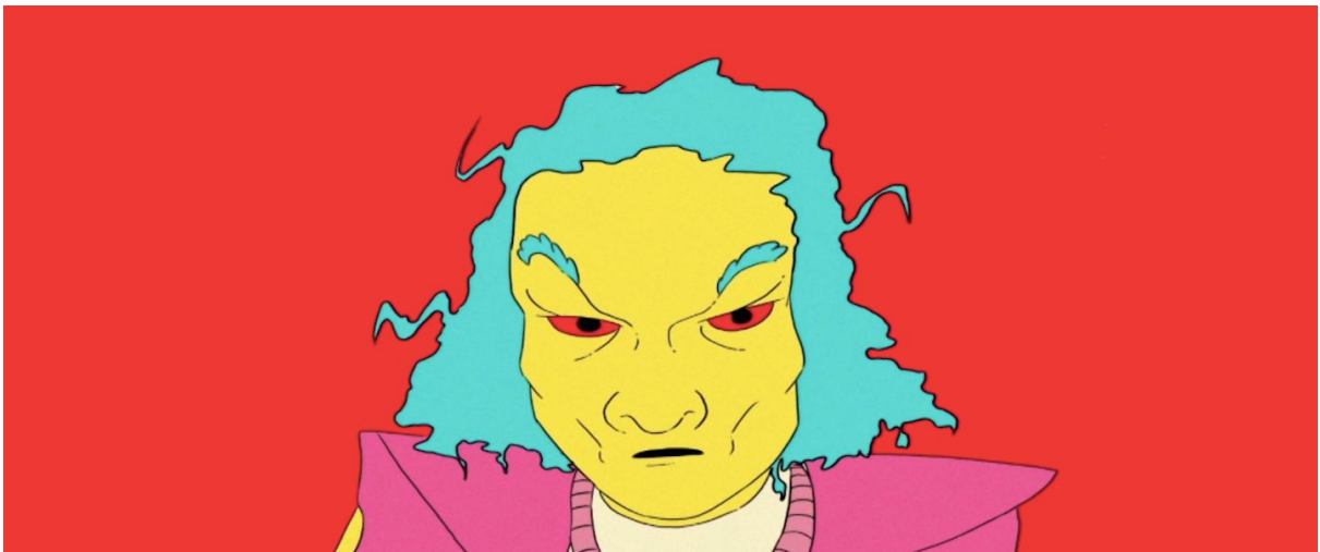
Drugs sequence, Animation