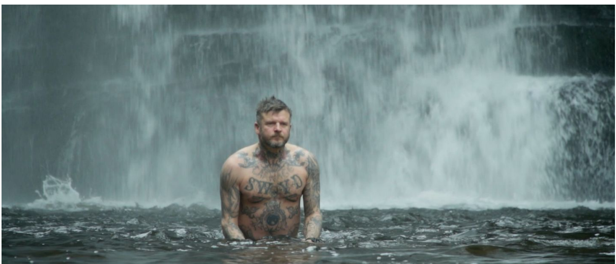
Post Sanchez sequence, sgwd yr eira waterfall, Brecon Beacons