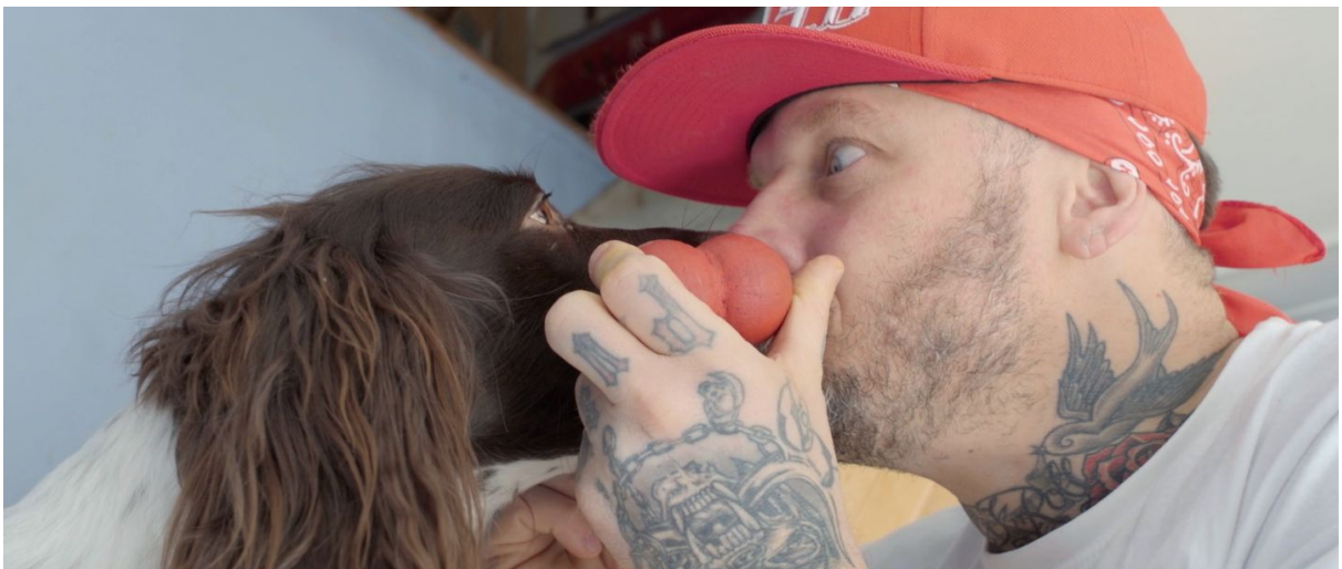
Dog sequence, Pritchard's home