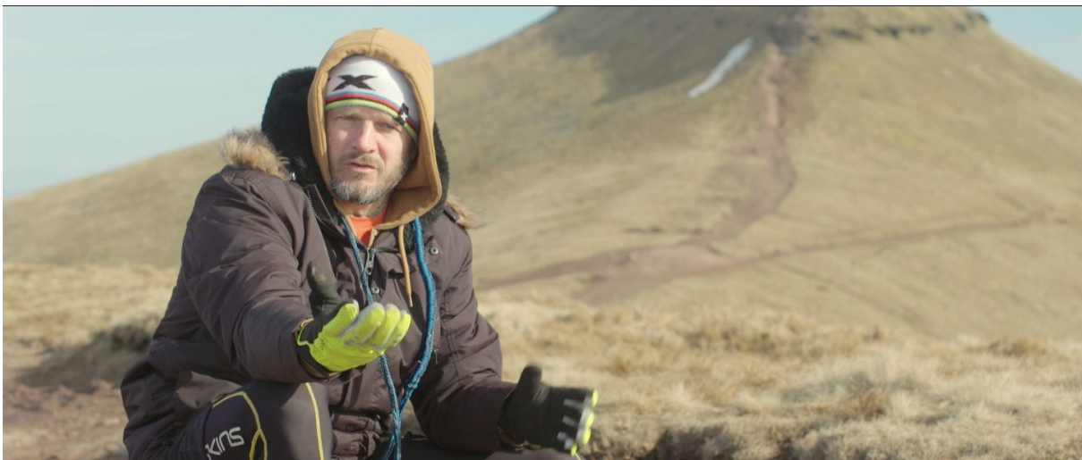
SWYD interview, Pen-y-Fan