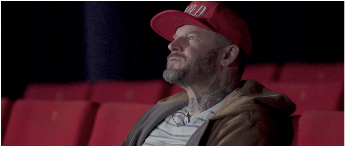
Reflective sequence, Chapter Arts Cinema