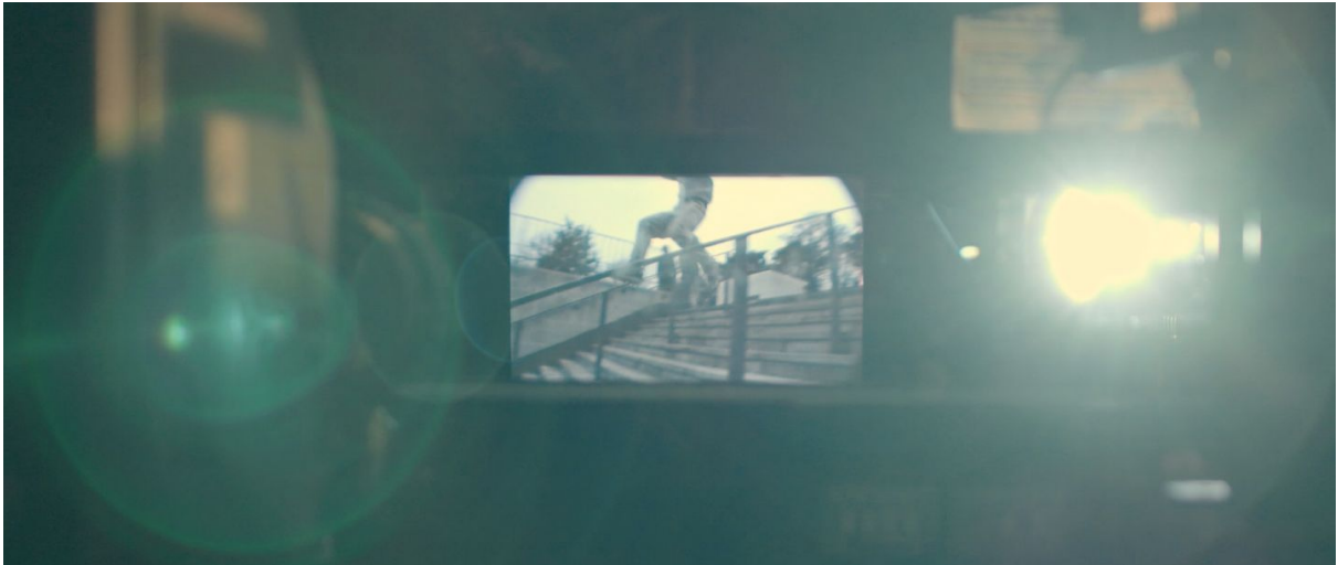
Reflective sequence, Projector's room