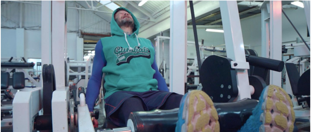
Fitness sequence, Peak Physique Gym