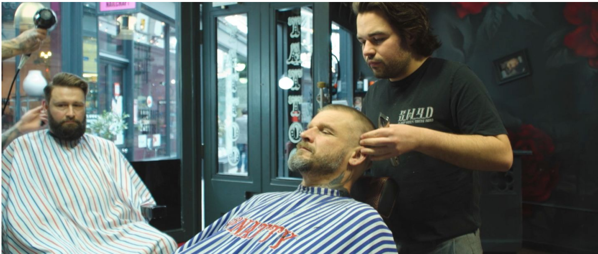
SWYD sequence, SWYD barber and tattoo shop, Castle Arcade