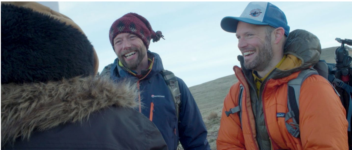
Actuality sequence, Pen-y-Fan