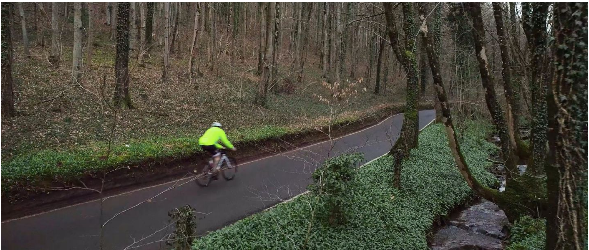
Fitness sequence, Caerphilly hills