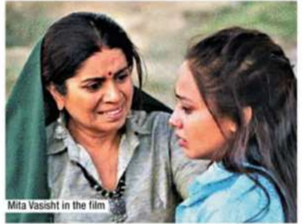
Mita Vasisht in the film