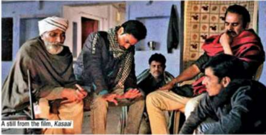
A still from the film, Kasaai

Feature in leading National Daily DNA After Hrs