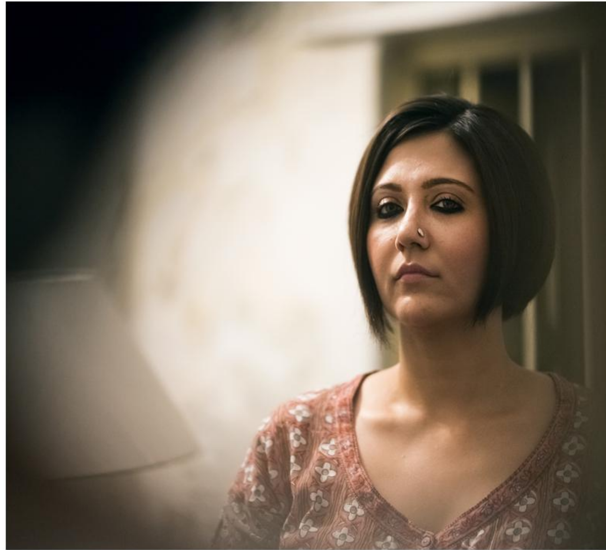
Swastika Mukherjee as Dia Chatterjee