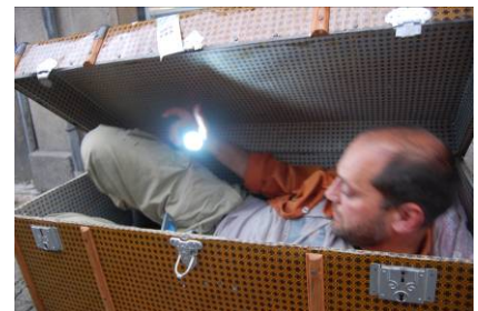
The performance at the opening of REDline exhibition in Porto, Portugal, 23 October 2008.