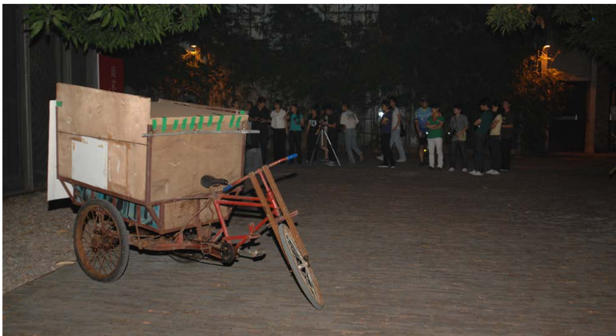
The performance at Shenzhen (23 Oct. 09) https://vimeo.com/17814039