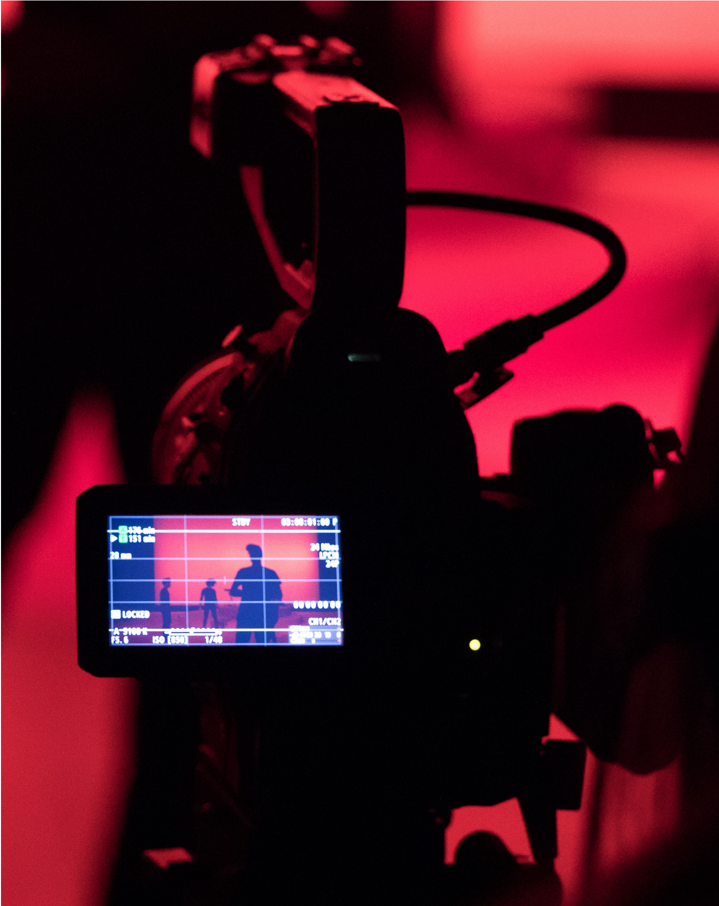
Chaos Theory was filmed on a C100 Mark 1