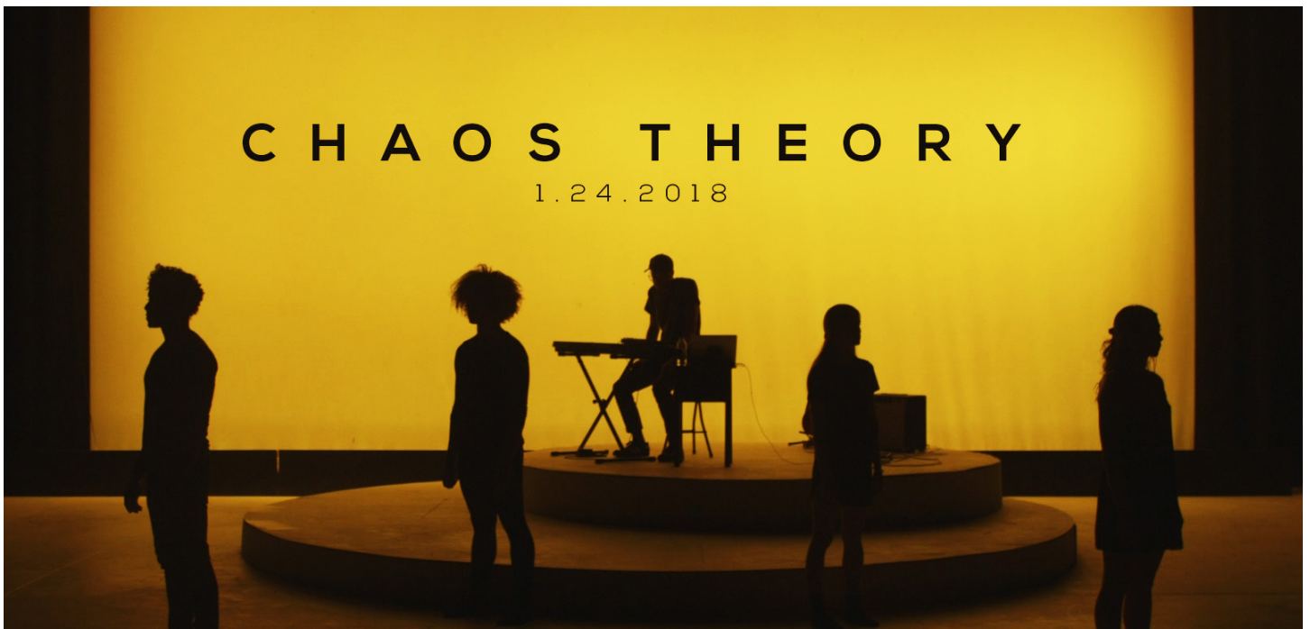
Teaser Poster for Chaos Theory.