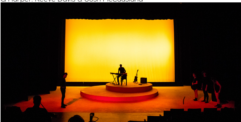
Film set of Chaos Theory