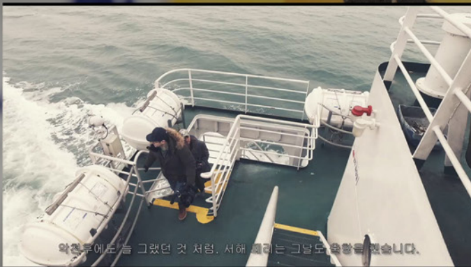
약물투여도 늘 그랬던 것 처럼. 서해 해리는 그날도 용항을 향합니다.