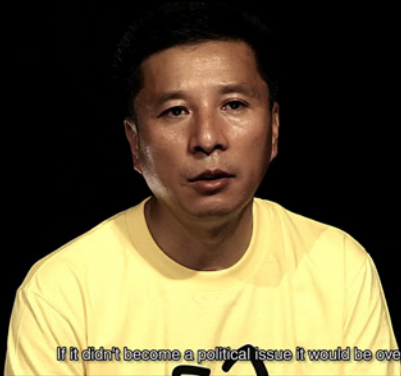
If it didn't become a political issue it would be over by now.