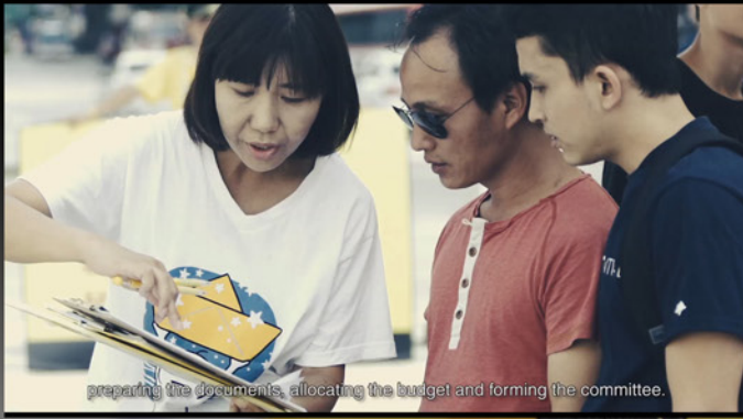
preparing the documents, allocating the budget and forming the committee.