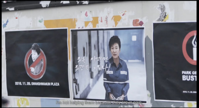
For not helping them because they are in pain.