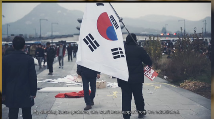
By showing these gestures, she won't lose support from the established.