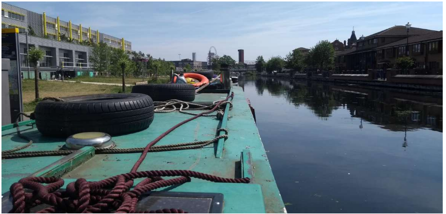
London! "The Wick" (Hackney Wick)

The little posse make their way to Hackney. As per their plan, they continue south past the Olympic site, towards historic Three Mills - Limehouse and The Thames beyond.