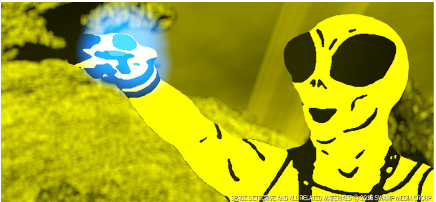
Steed Corulla as TH-U6

SPACE DETECTIVE AND ALL RELATED MATERIALS © 2016 SWAMP MEDIA GROUP