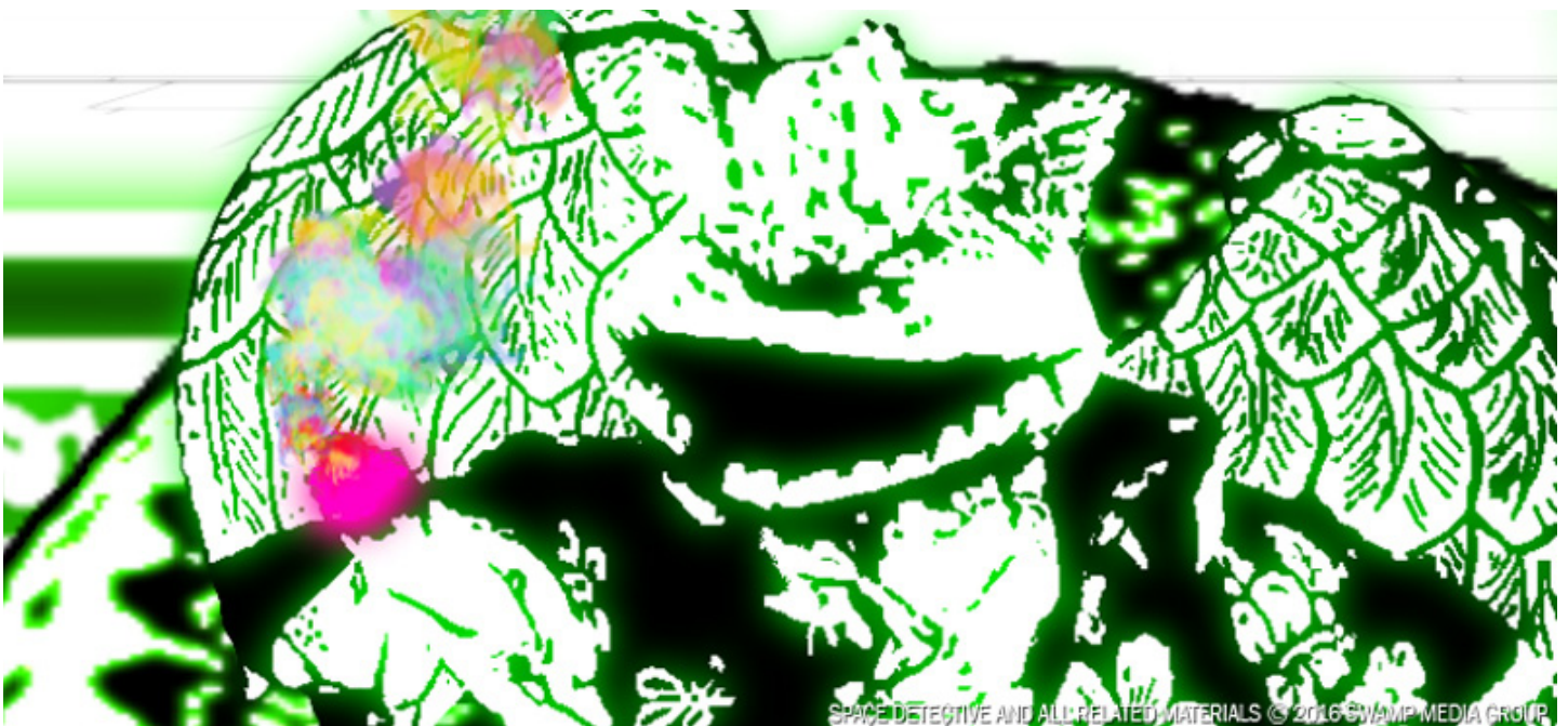
Matt Sjaforoeddin performing CHI-MENG THE MAGNIFICENT!