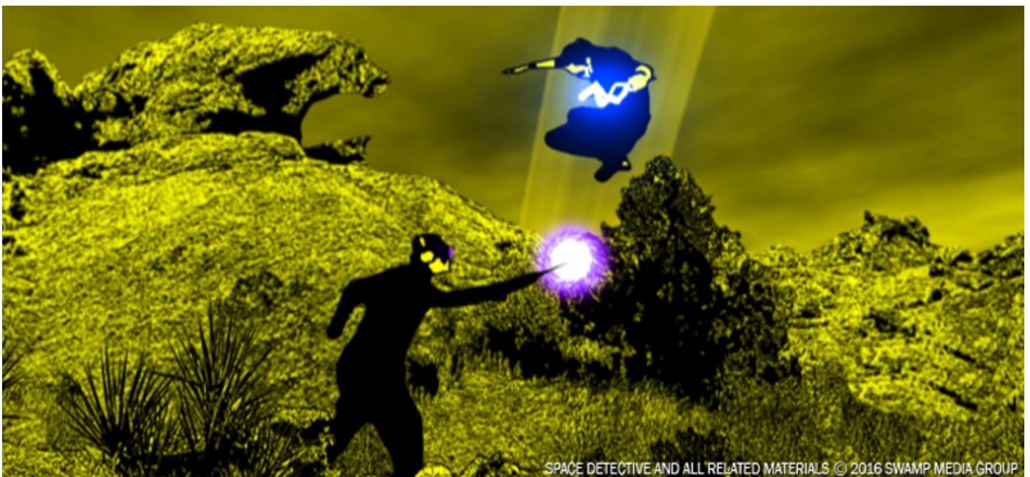
SHIRO vs TH-U6: Showdown on SYLU!