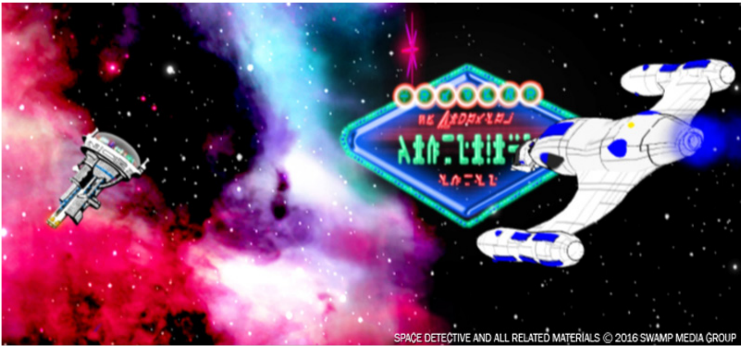
SHIRO races to CARINA DAWN!