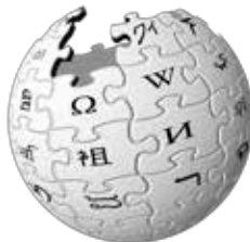
WIKIPEDIA The Free Encyclopedia