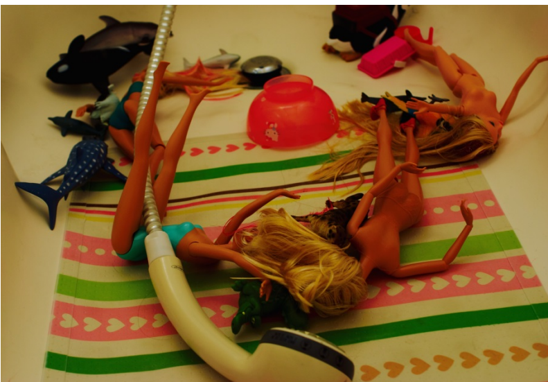
Concept still for "Beauty School"