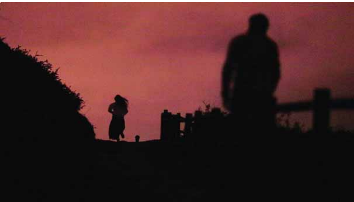
Xivares was one of the scenes of the shooting