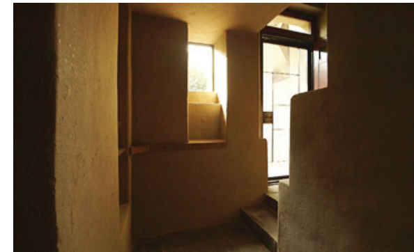
Sadhana's House Rakkar • Built in 2000