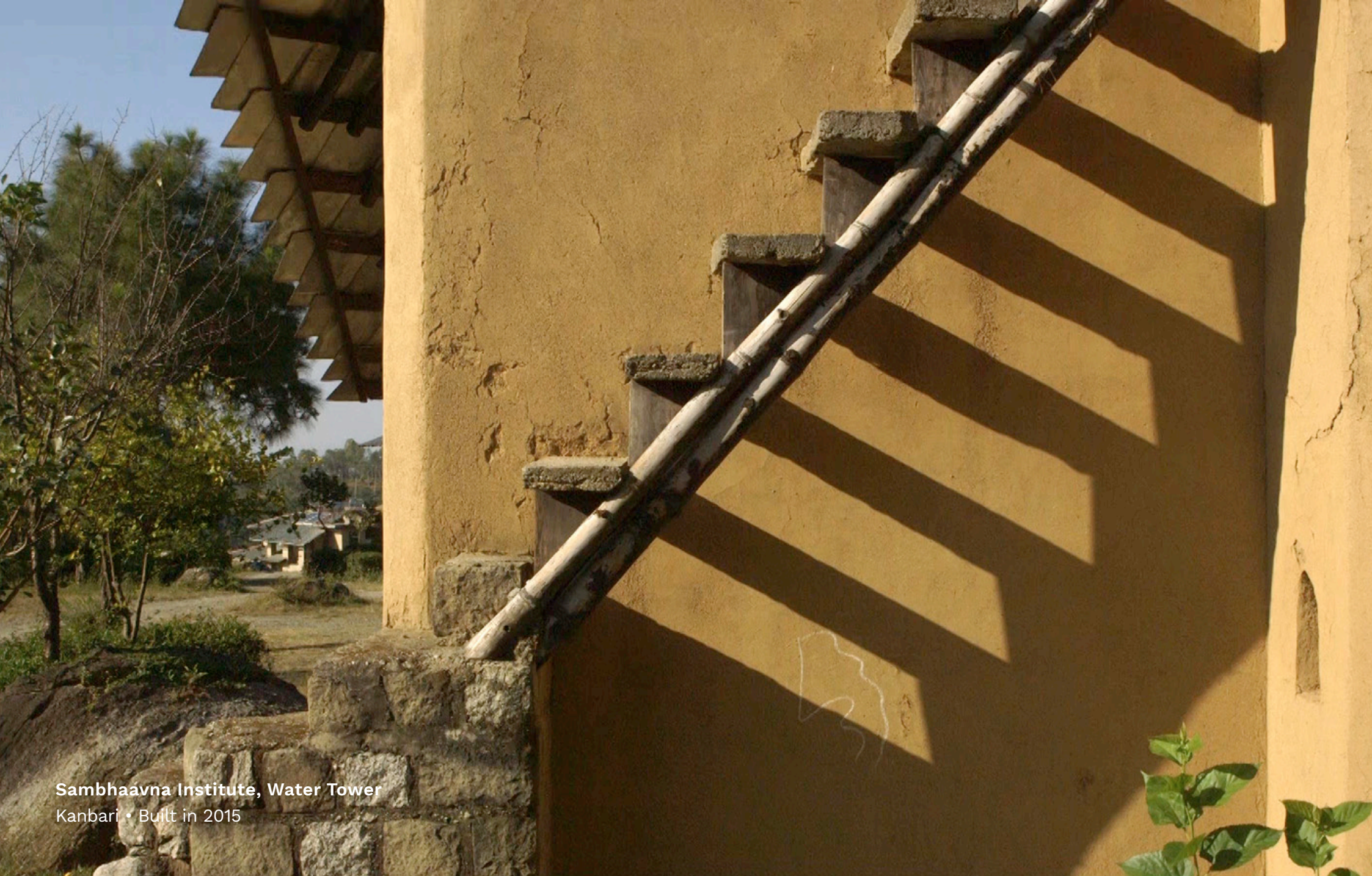
Sambhaavna Institute, Water Tower Kanbari • Built in 2015