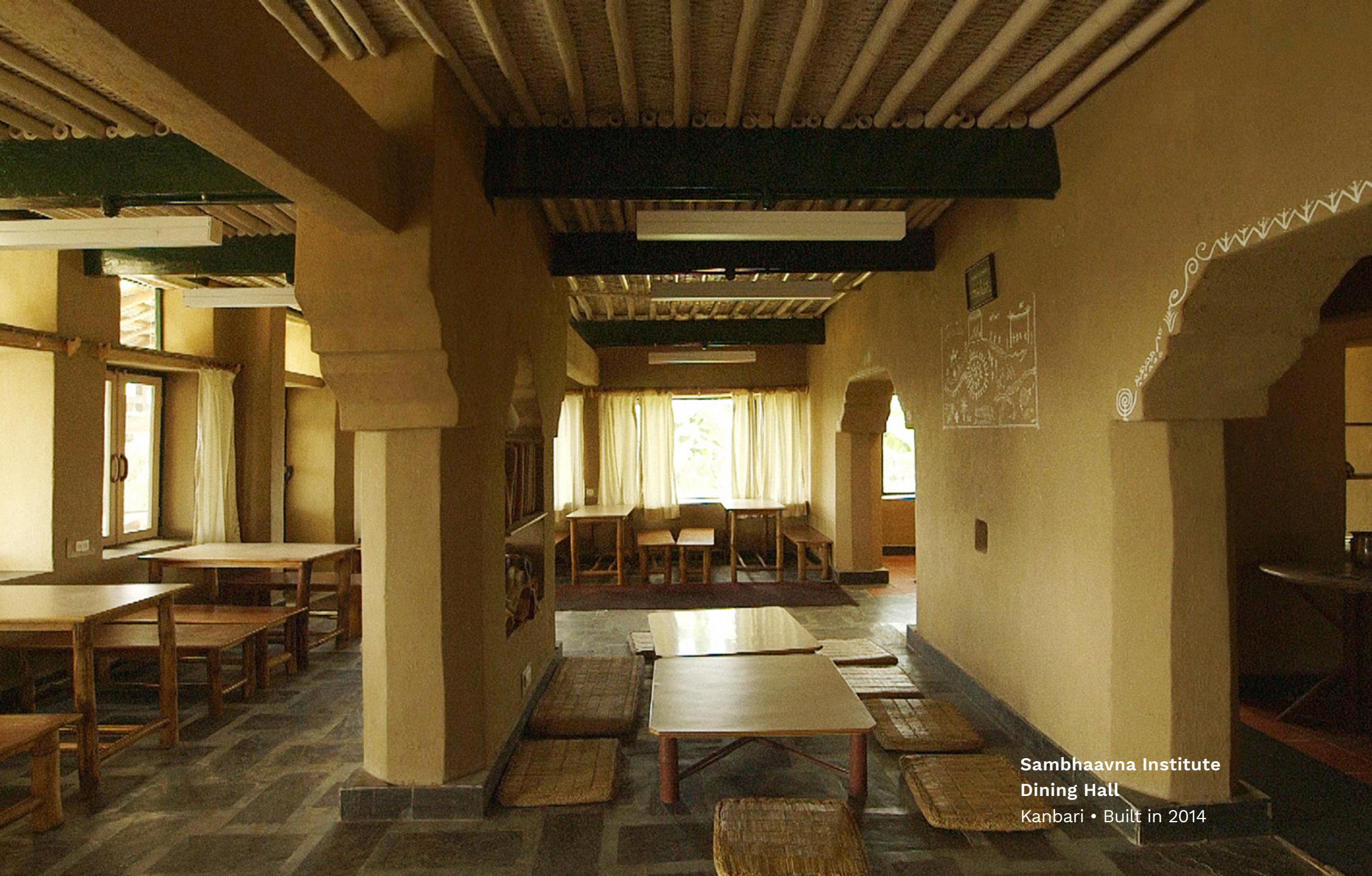
Sambhaavna Institute Dining Hall Kanbari • Built in 2014