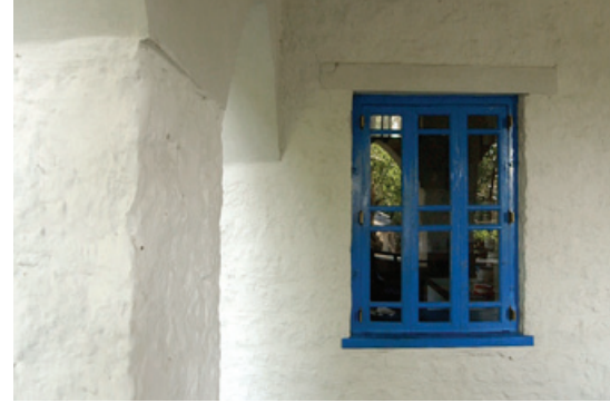
Nishta Health Clinic Rakkar • Built in 1995