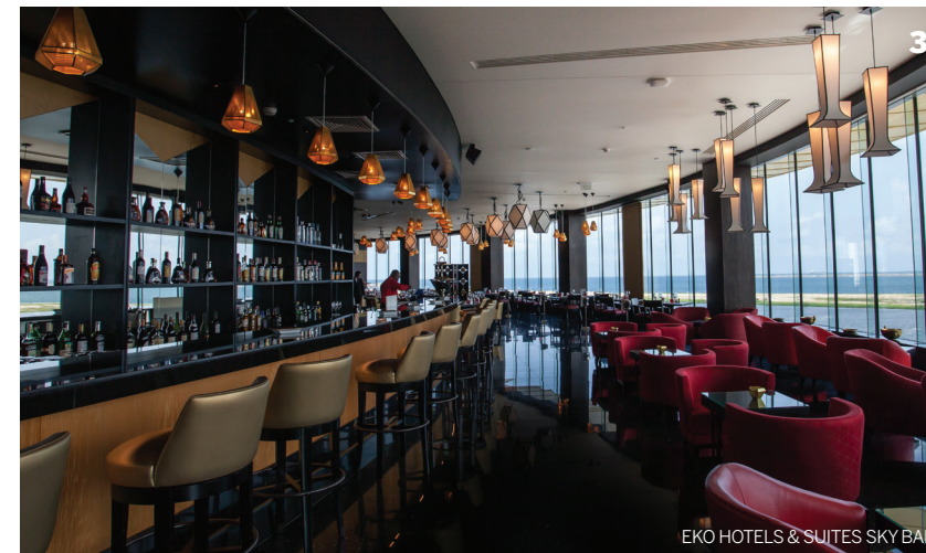
EKO HOTELS & SUITES SKY BAR

Green space is hard to come by in Lagos so one natural stop is the Lekki Conservation Centre . One of the Nigerian Conservation Foundation (NCF) projects, it has strategically placed, raised walkways where you can spy crocodiles, monkeys, tropical birds, snakes and giant rats.