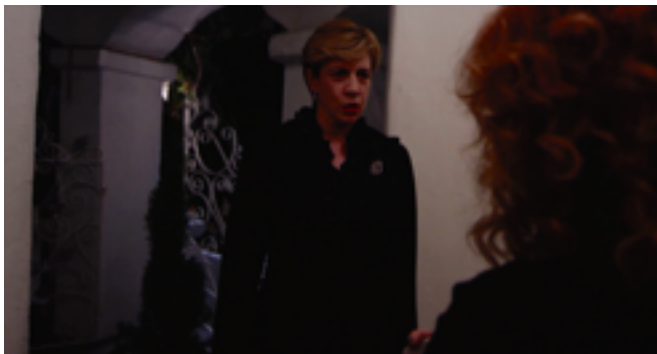
A visit by a mysterious woman...