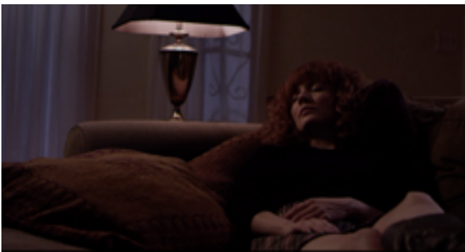
Sleeping, unaware of what's lurking outside...