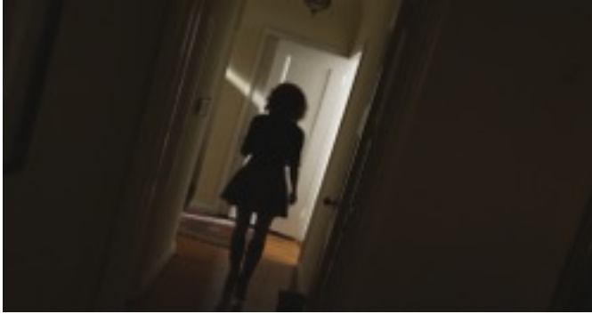
Courtney investigates the sound.