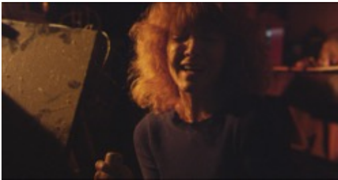
Locked in the basement...