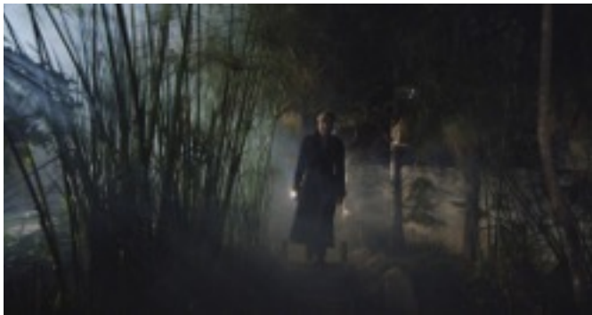
The mysterious visitor approaches...