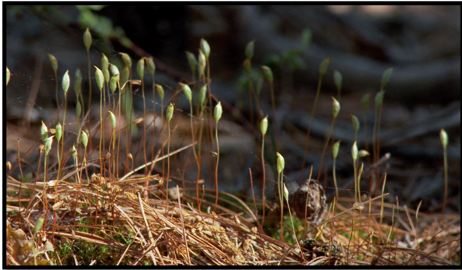
Walden Pond, Concord, Massachusetts

“Let your life be a counterfriction to stop the machine.” –Thoreau