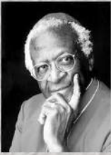
Desmond Tutu Nobel Peace Laureate

was awarded the Nobel Peace Prize in 1984 for his courageous leadership in efforts to find a nonviolent solution to the conflicts over the policy of apartheid in South Africa. In 1986 he became the first black person to be Archbishop in the Anglican Church of South Africa. Today, Archbishop Tutu continues to be a world leader in the struggle for human rights.