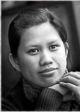
Charm Tong Courage

was awarded the Nobel Peace Prize in 1984 for his courageous leadership in efforts to find a nonviolent solution to the conflicts over the policy of apartheid in South Africa. In 1986 he became the first black person to be Archbishop in the Anglican Church of South Africa. Today, Archbishop Tutu continues to be a world leader in the struggle for human rights.