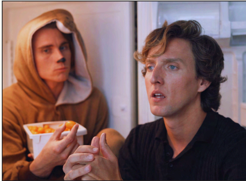
K IS FOR KUMQUAT WRITER/DIRECTOR, SHORT FILM WATCH HERE