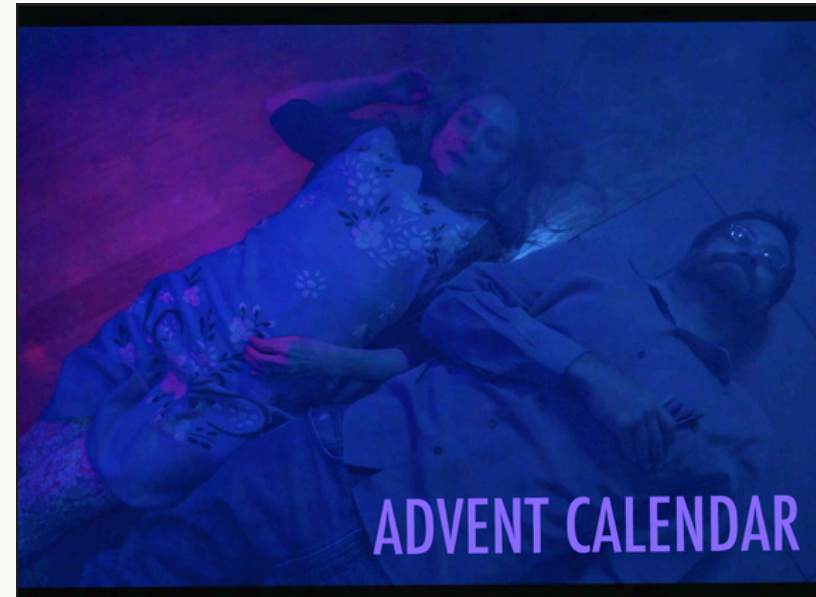
ADVENT CALENDAR DIRECTOR, SHORT FILM WATCH HERE