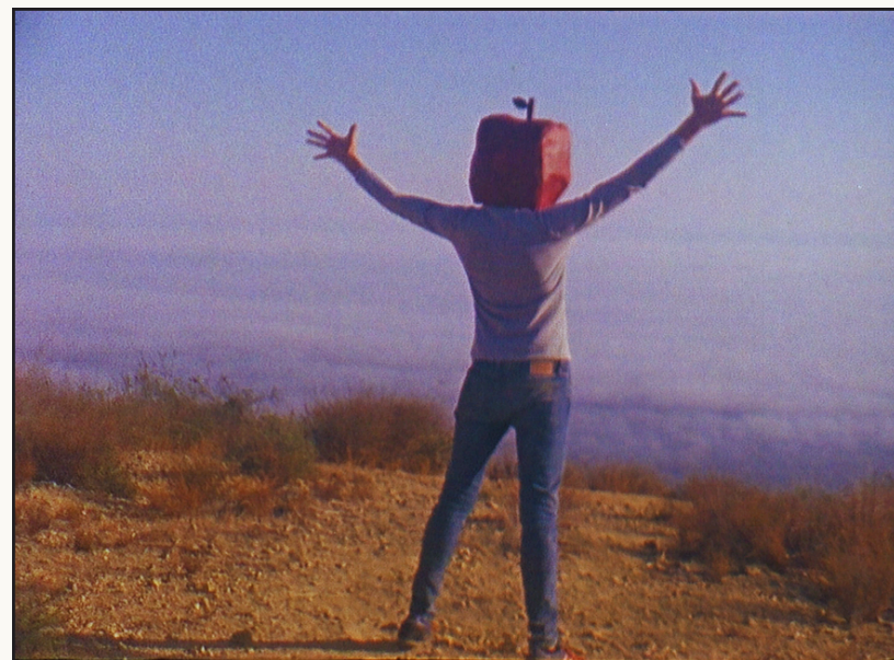
AN APPLE A DAY WRITER/DIRECTOR, SHORT FILM WATCH HERE SHOT ON SUPER 8