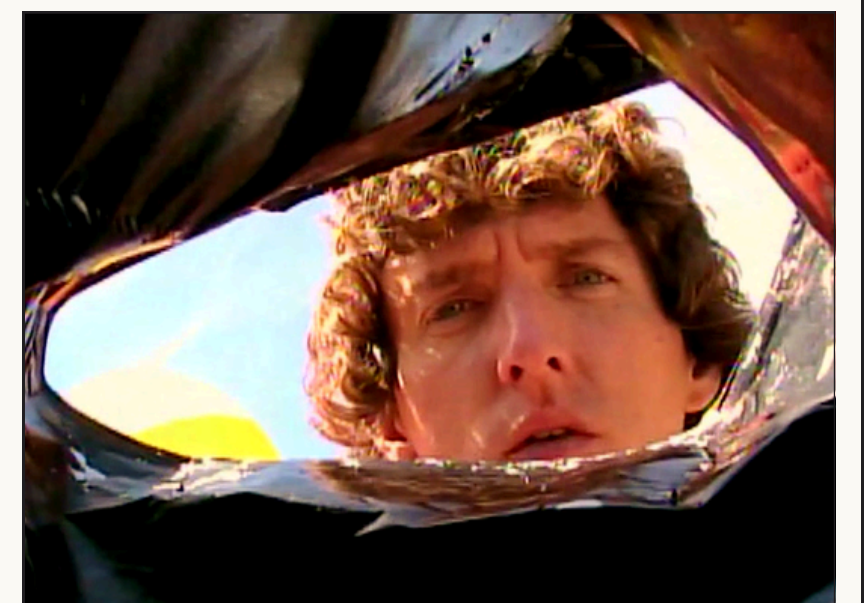
SANITY WRITER/DIRECTOR, MOCK COMMERCIAL WATCH HERE SHOT ON VINTAGE CAMCORDER