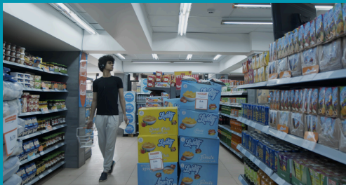
Dreamy, Uncertain, And Dying Everyday (2025)