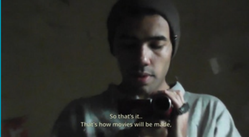
Lolita—Cytokine Storm (2023)