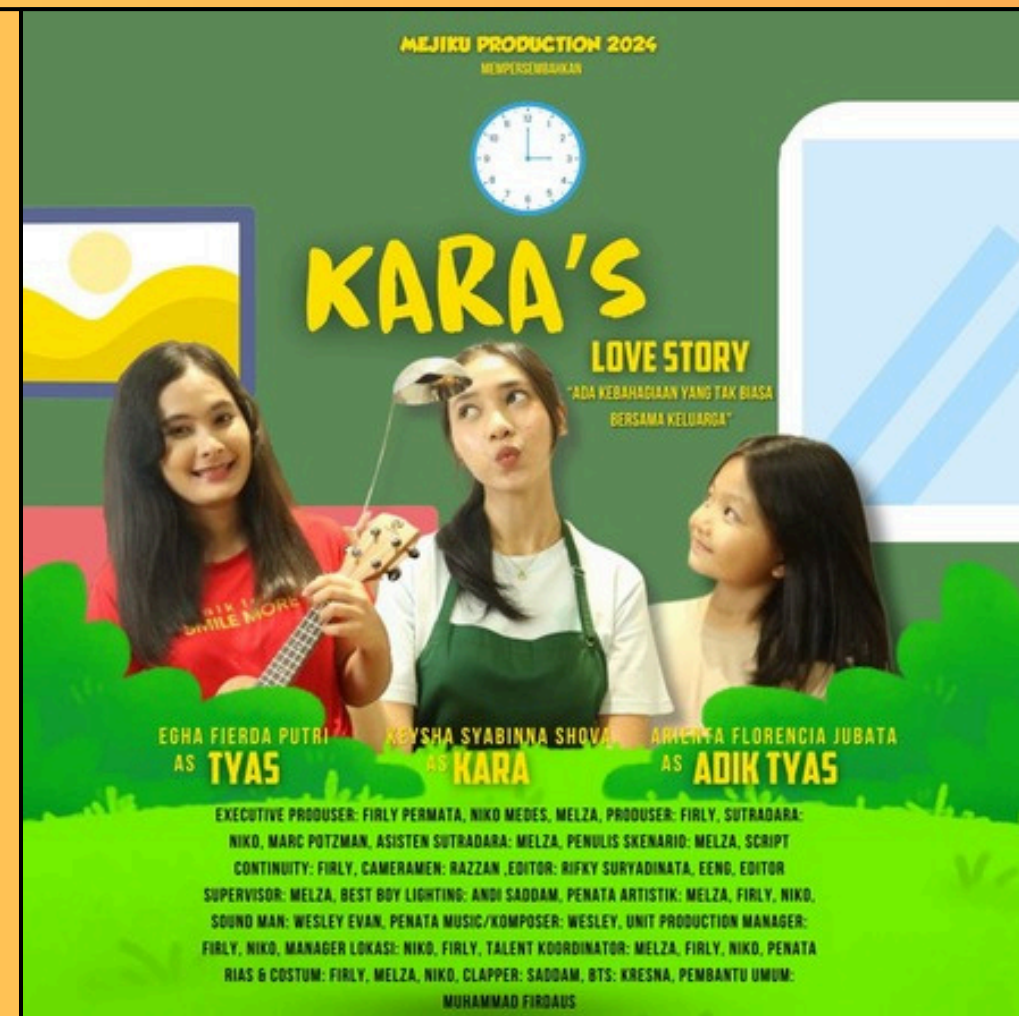
KARA'S LOVE STORY