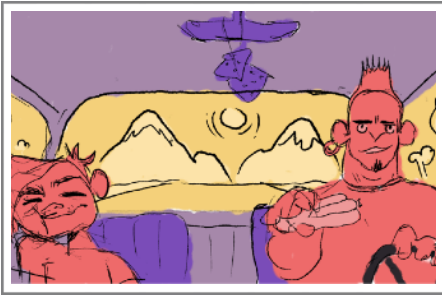
ALL YOU CAN WATCH (2023)