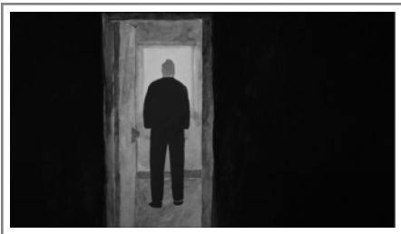
VILLE NEUVE (2019)

- A part-time job in which I cleaned and inked the line work of fellow animators for a Quebecois feature film entitled Ville Neuve (2019).