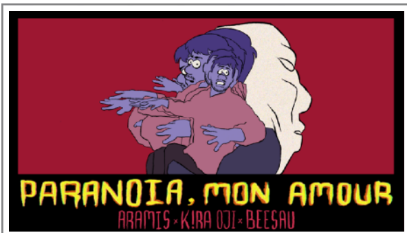
PARANOIA, MON AMOUR (2024)