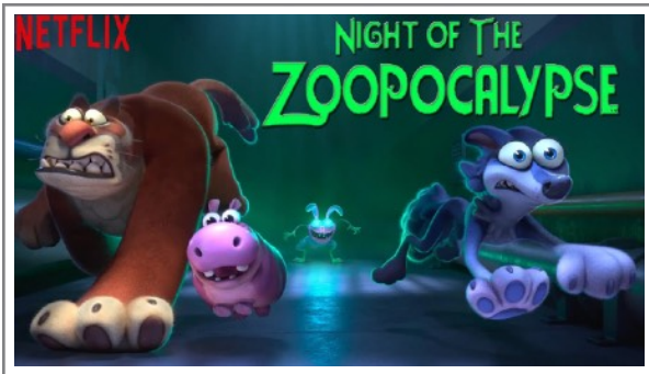
NIGHT OF THE ZOOPOCALYPSE (2024)

PORTFOLIO: CLICK HERE // DEMO REEL: CLICK HERE