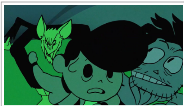
THE VERY HAUNTED JOJO BROS (2022)

- Established the post-production pipeline (editing processes, file management) applied across various Animarc projects, as well as for onboarding assistants.