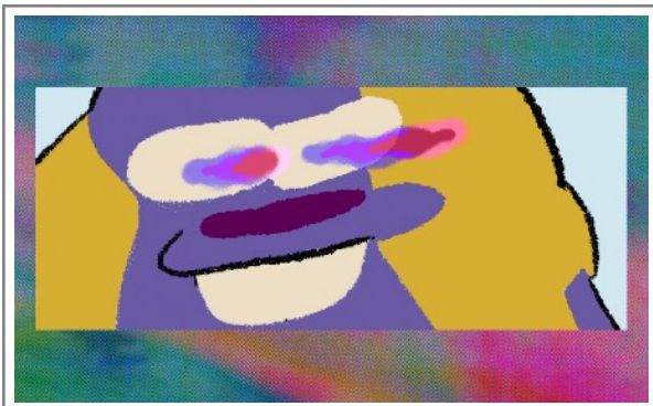
RABBIT HOLE (2023)

- Lead editor for 56 video courses, averaging 10 minutes each, developed by Animarc and Hardscaper (in collaboration with Techo Bloc). Both English and French versions were produced.