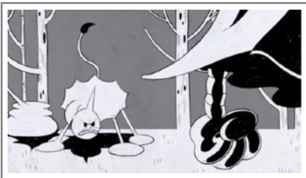
THE FORTUNATE ISLE (2020)

I directed, edited, and composed the promotional animation to accompany the Kickstarter campaign I co-managed for my 76-page graphic novel The Fortunate Isle . The campaign was successfully backed (at 135% of the funding goal).