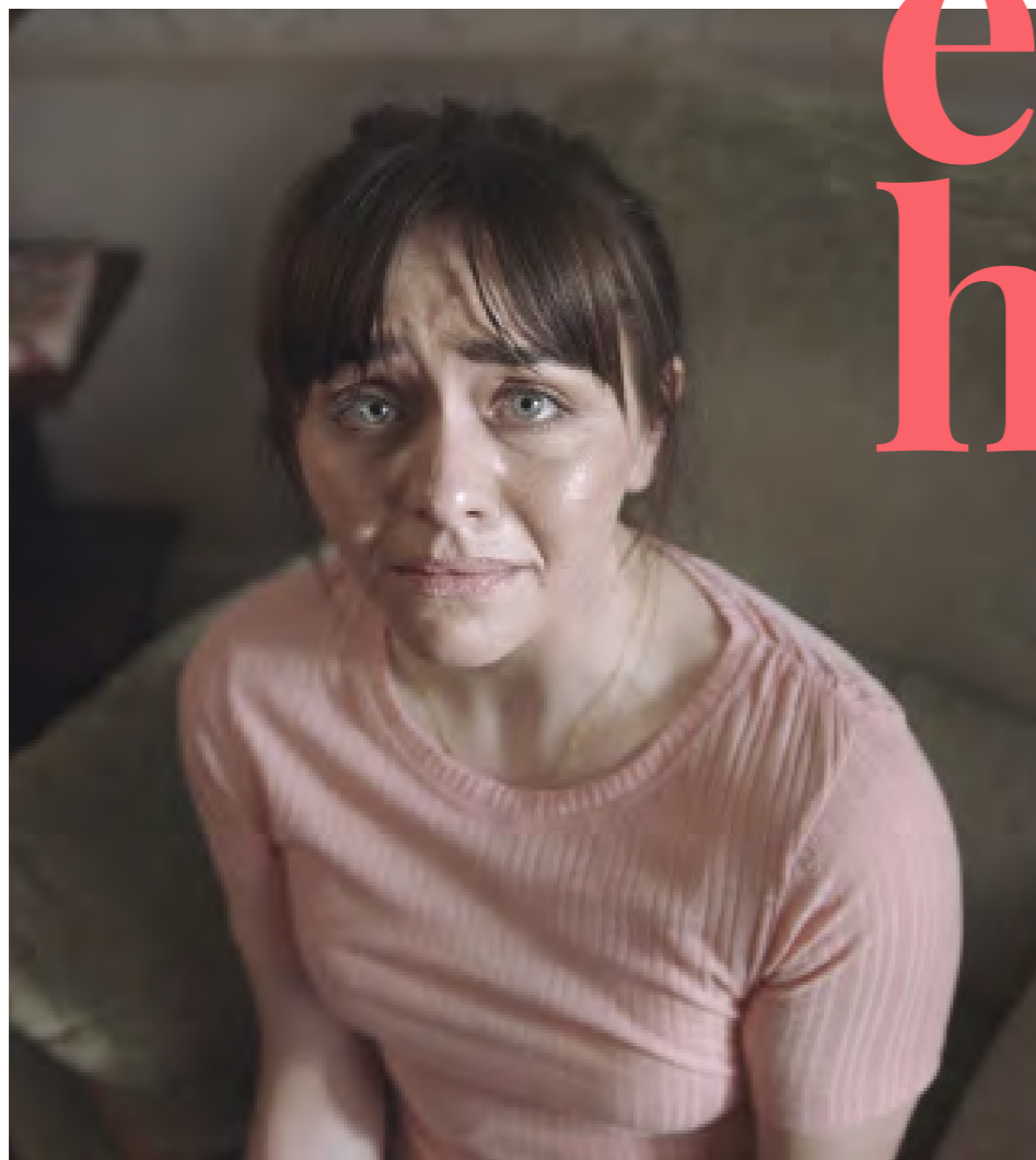
Click to view work: Department of Justice