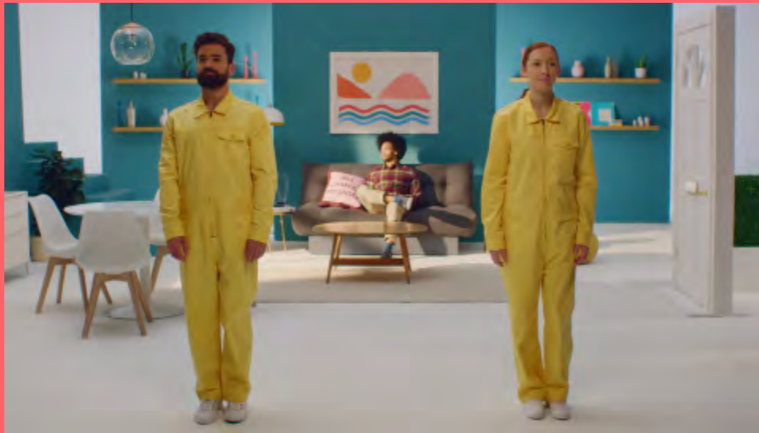
Click to view work: Current Account Switch Service