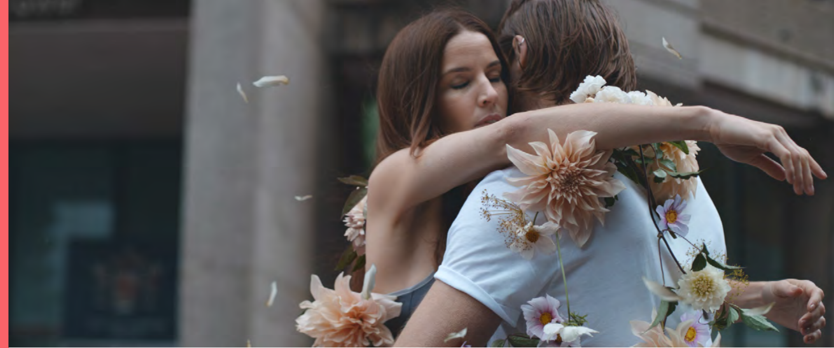
Click to view work: Gravity's Law

I've worked extensively with BBC / Red Bee Media / Sky Creative / ITV / Channel 4 / UKTV / Ogilvy UK / Hogarth Worldwide / Engine Creative / Karmarama / Kream / Mill+ / Mainframe / Iris Worldwide / McCann / AMV BBDO / Digitas LBi / MCGarrybowen / The Story Lab / AKQA London.