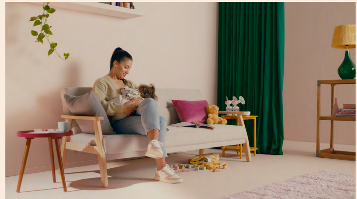
Click to view work: Tommee Tippee #TheTruthIs

I'm personable, collaborative and deliver authentic performances.