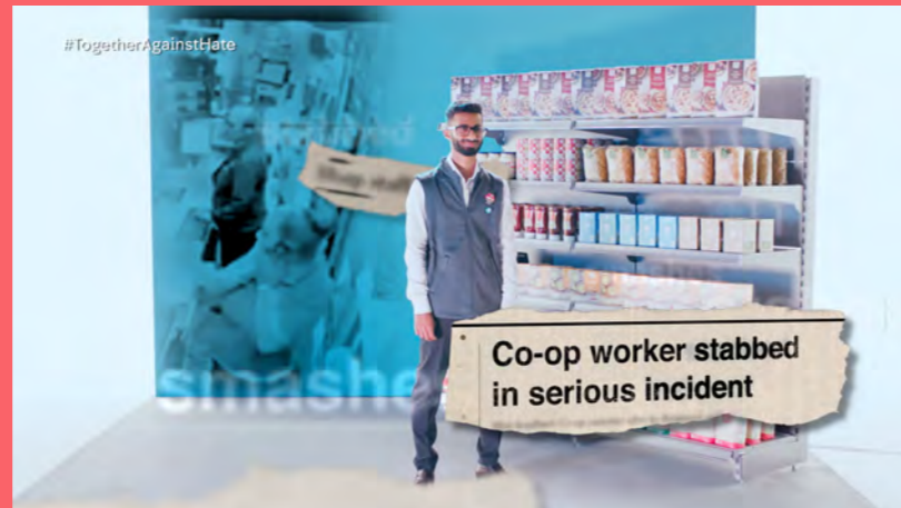
Click to view work: Together Against Hate