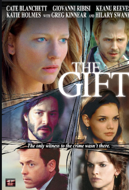
The Gift $44,567,606