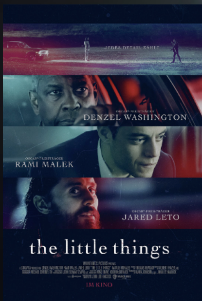
The Little Things $29,844,012