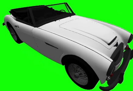
1967 Austin Healey 3000