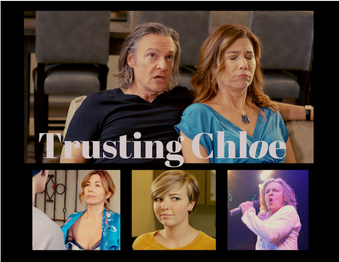
Trusting Chloe postcard

“Timothy, who said anything about spying ? I’m simply asking you to follow a group of kids without them knowing, take a few pictures, and report back to me. Does that sound like spying to you?!”