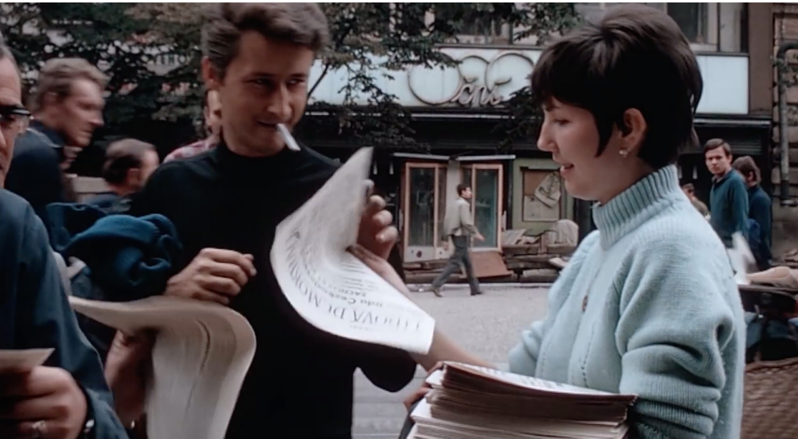
Still shot from newly discovered archival film