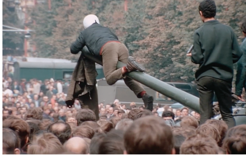
Recently discovered 16mm film of the 1968 invasion