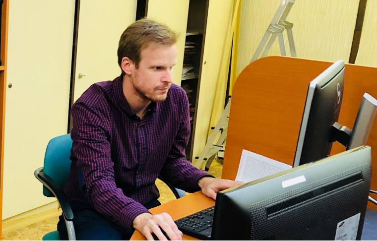
Archival research in Prague