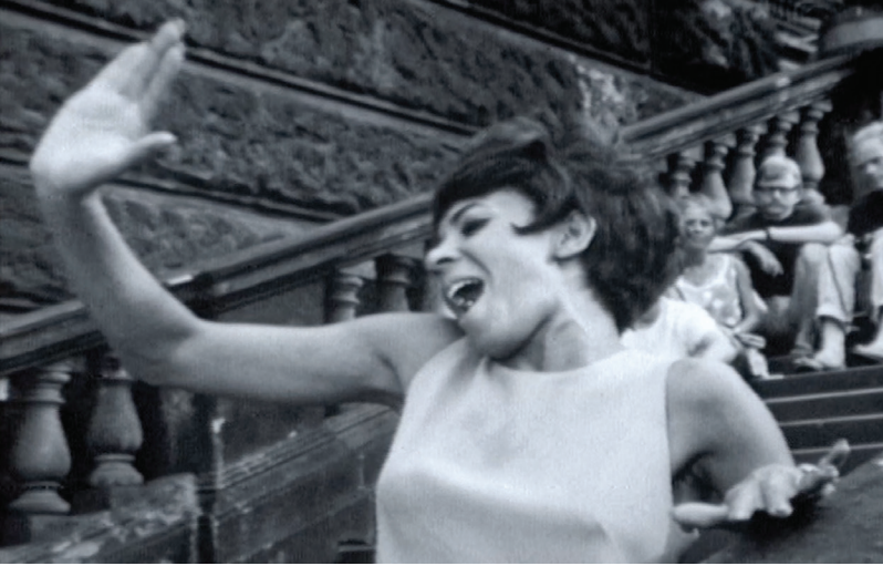
Shirley Bassey singing in Prague in August 1968