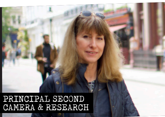
PRINCIPAL SECOND CAMERA & RESEARCH