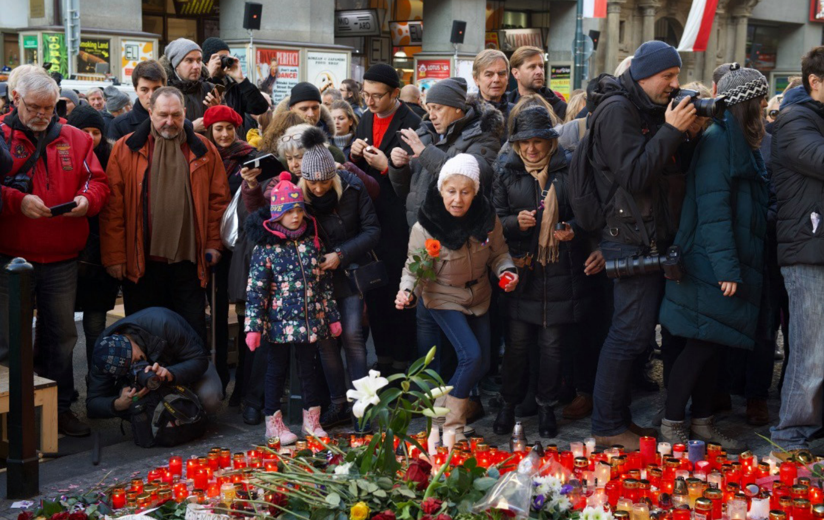
Memorial, Nov. 17, 2018, Prague