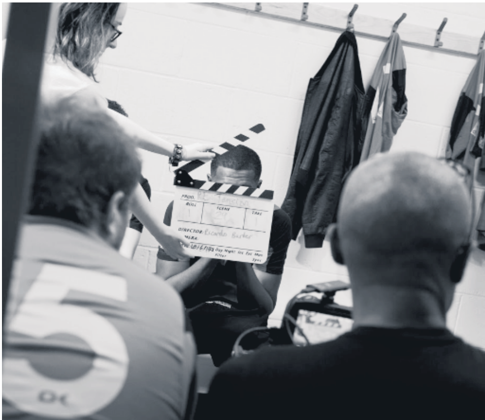
FILM: Re:Tension will premiere in Leeds.