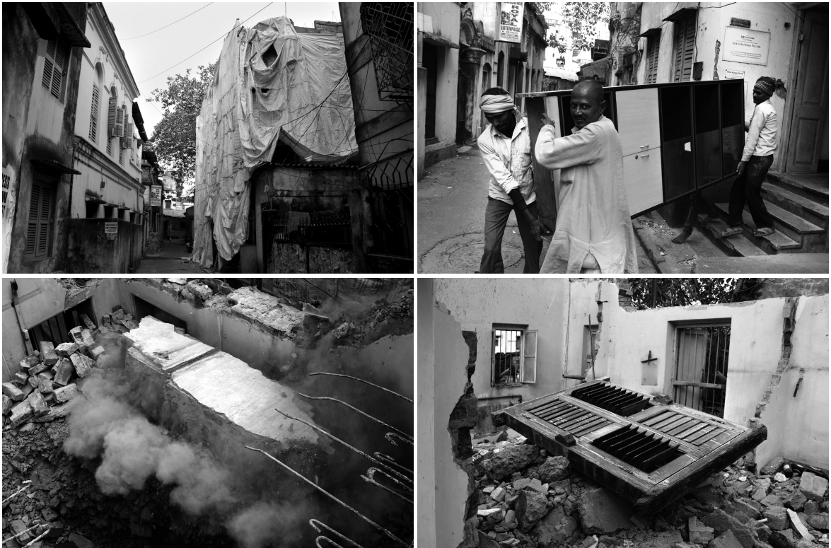
Film stills- Khwto

"The Wound brings to life what Edward Weston said way back in 1924. "The camera should be used for a recording of life, for rendering the very substance and quintessence of the thing itself whether it is polished steel or palpitating flesh."