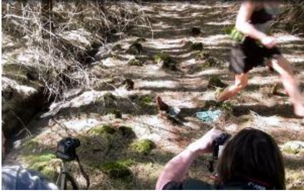
Establishing light with moving bodies is not easy.