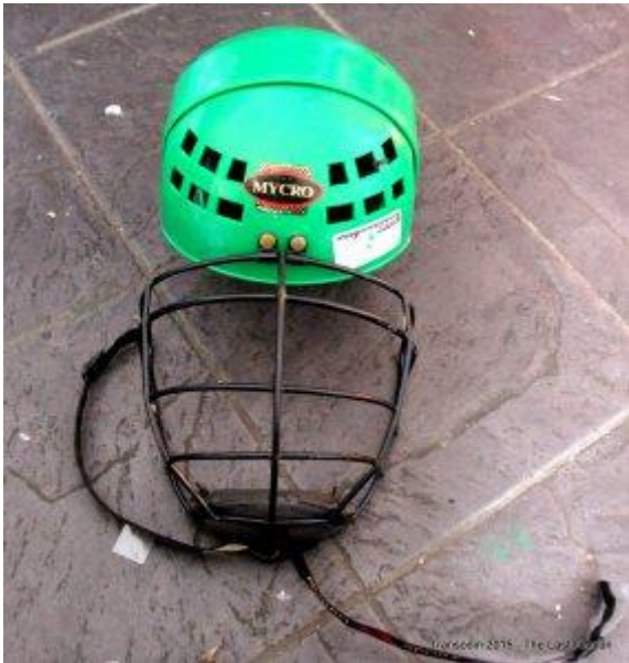
This is the basic/initial sparkle idea of this film!