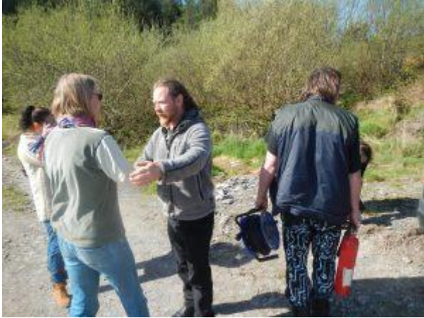
Meeting the Team.