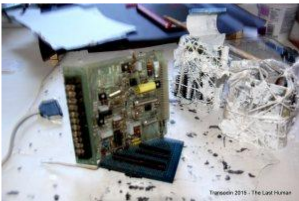
First Props or rather sculptures developed.