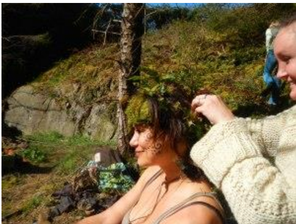
Working Make Up Artist.