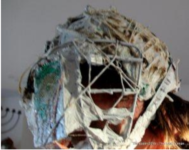
MASK from the left. Unfinished.