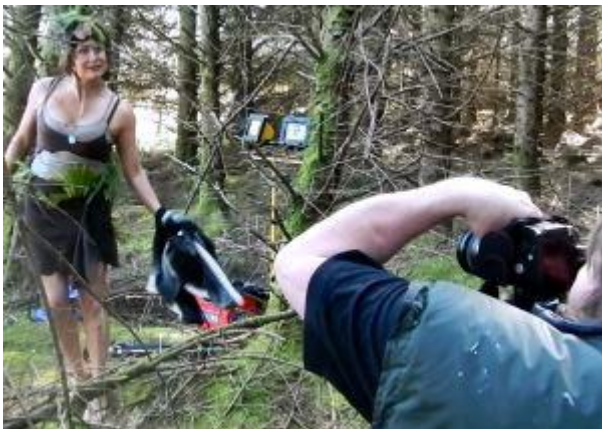
Testshots with light.